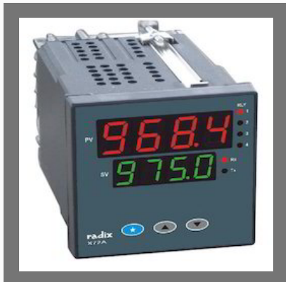
Programmable OnOff Controller X72A