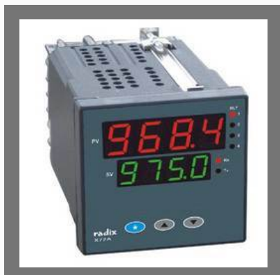
Programmable Onoff Controller X72a