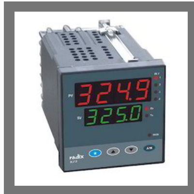
Autotune PID Controller X72