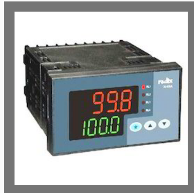
Programmable On Off Controller X49A