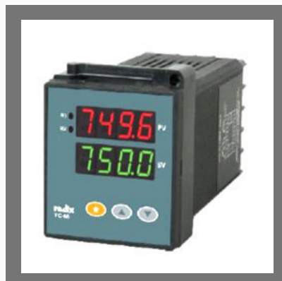
Programmable On Off Controller TC48