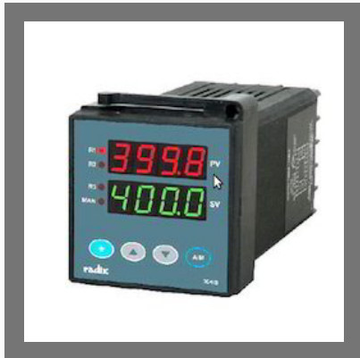
Autotune PID Controller