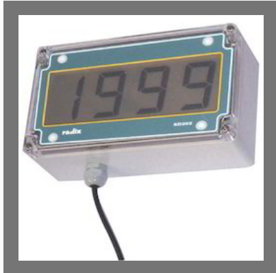
Loop Powered Indicator SD202