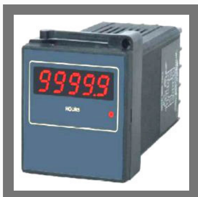
With Non-volatile Memory Timers Mt 481, Mt 482