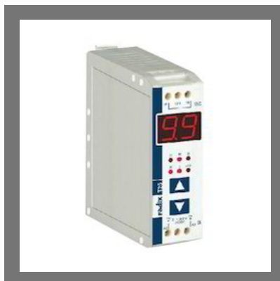
Without Memory Digital Din rail Timer T 25