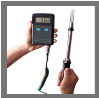
Handheld Digital Thermometer - TC K