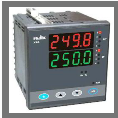
Autotune PID Controller X96