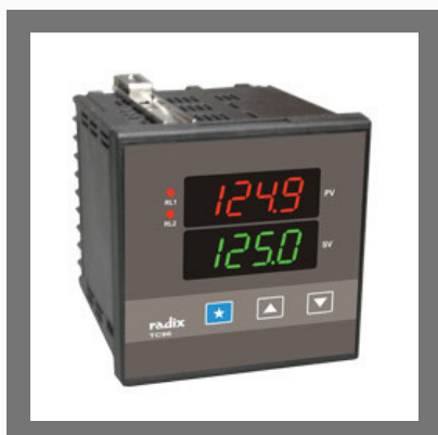
Manual Loader/Auto-manual Station TC96