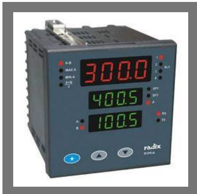
Differential Temperature Controller