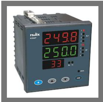
Autotune PID Controller X96p