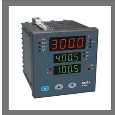
Differential Temperature Controller X96D