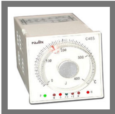
Blind Temperature Controllers