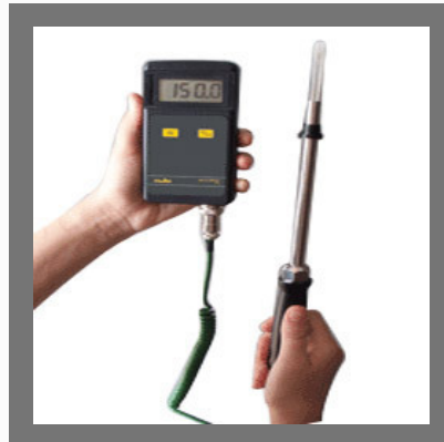
Handheld Digital Thermometer - Pt100