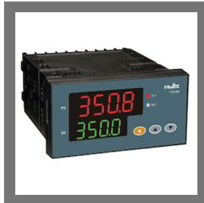
Programmable Temperature / Process Controllers