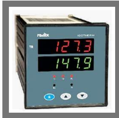
TR Meter Isotherm