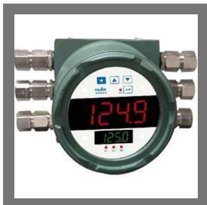
Flameproof F, IP66