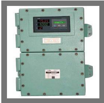
Multi-Channel Scanner ISOSCAN-Tmax