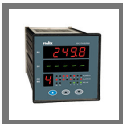
Multi-Channel Scanner ISOTHERM