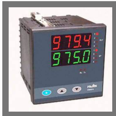
Programmable Onoff Controller X96a