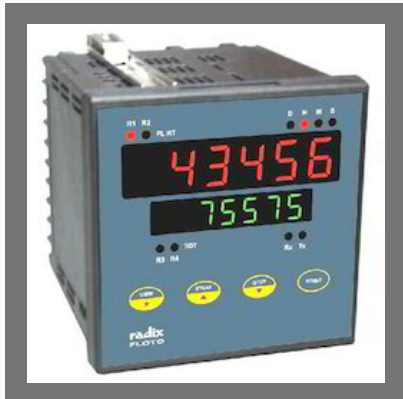
5-Digit Process Indicator With Alarms Floto