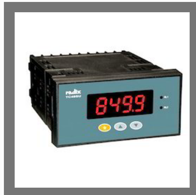
Programmable ONOFF Controller TC49SU