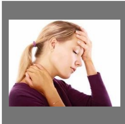
Cure Migraines & Headaches