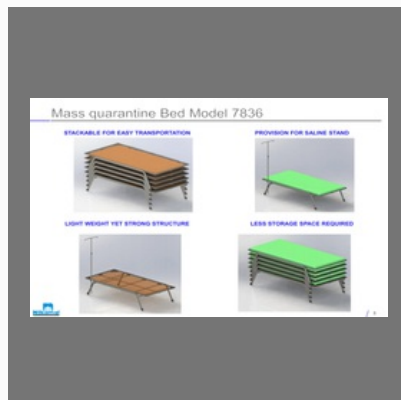
Mass Quarantine Bed