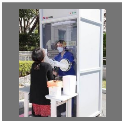
Corona / COVID-19 Testing Booth