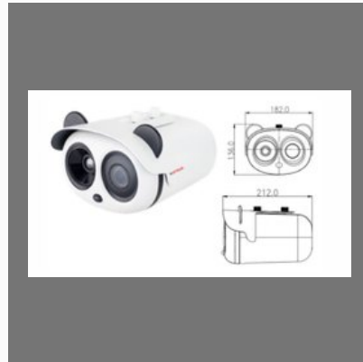
Body Temperature Detection Camera