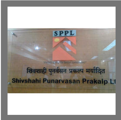
Acrylic Sandwich Sign Board