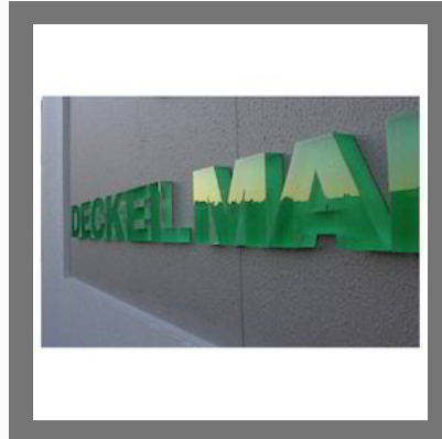
Acrylic Signage Board