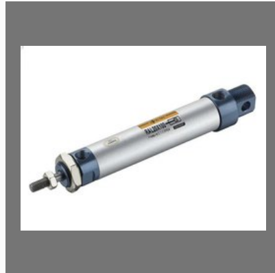
RAL Series Mini Pneumatic Cylinder