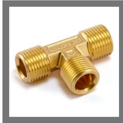
Branch Male Tee (BSPT) Tube OD