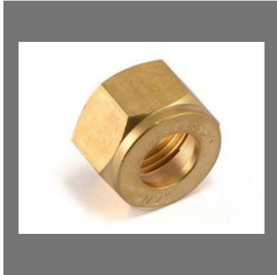
Brass Olive Nut