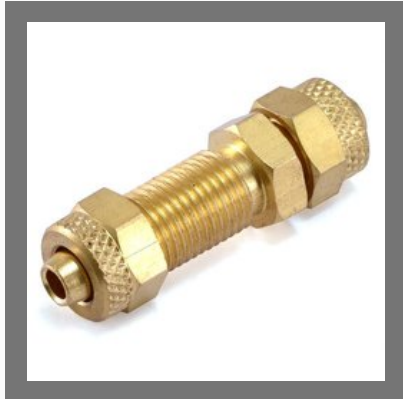
Brass Bulkhead Union