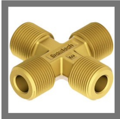
Brass Male Four Way