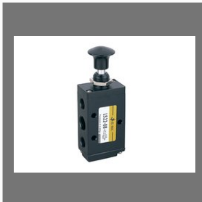
L Series Hand Pull Valve