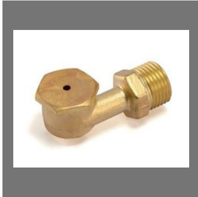
Brass Cooling Tower Nozzel