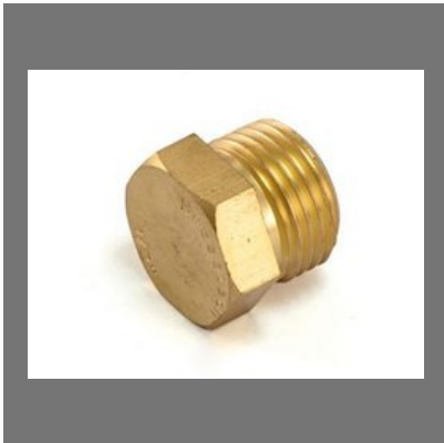
Brass Hex Head Plug