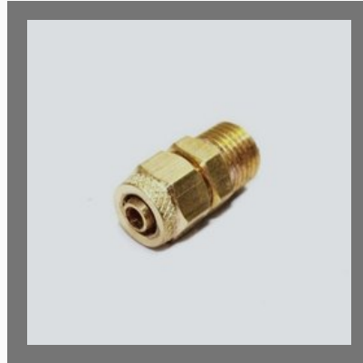
Brass PU Male Connector