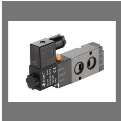
RV series NAMUR solenoid valve