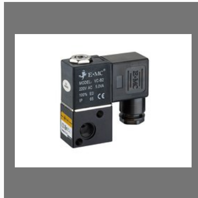
V221/VP321 Series 3/2 Solenoid Valve