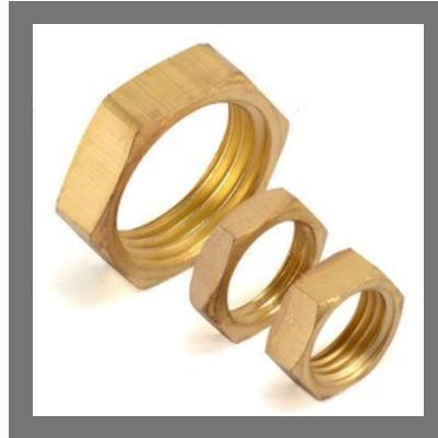
Brass Hex Nut