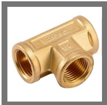
Union Female Tee