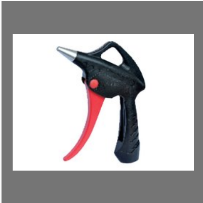
Pneumatic Air Gun