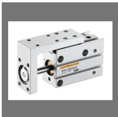
EXH Series High Precision Slide Pneumatic Cylinder