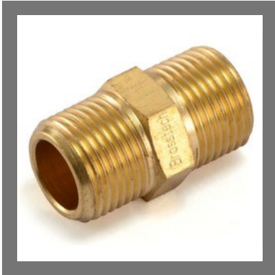
Brass Hex Nipple