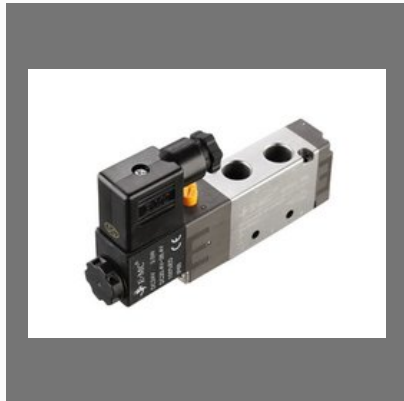
NRV Series Low Power Solenoid Valve