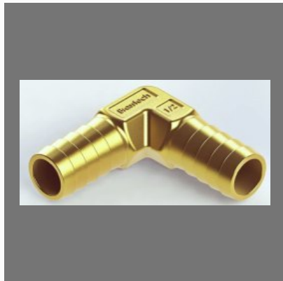
Brass Elbow Joint Nipple For Hose Fittings