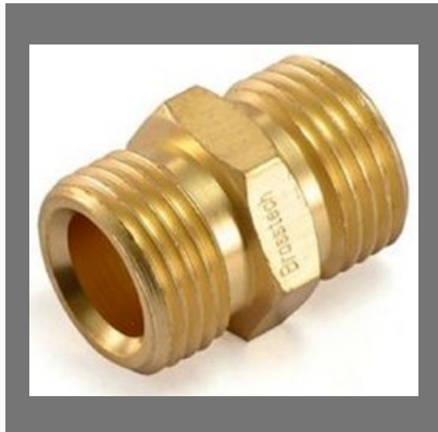
Brass Olive Union BSP For Brass Pipe Fittings