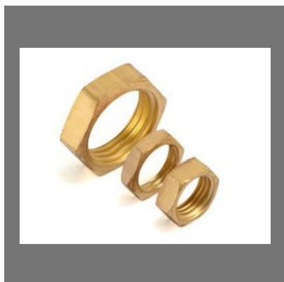
Brass Check Nut