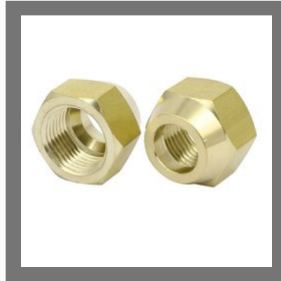
Brass Flare Nut Short Neck