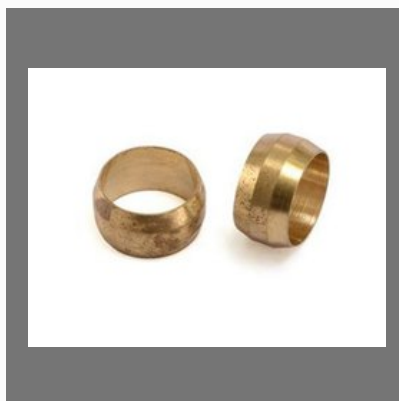
Brass Olive Sleeve