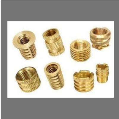
Brass Round Moulding Insert