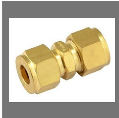
Brass Olive Union Assembly For Brass Pipe Fittings