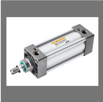
VBC/LBC series ISO1552 pneumatic cylinder