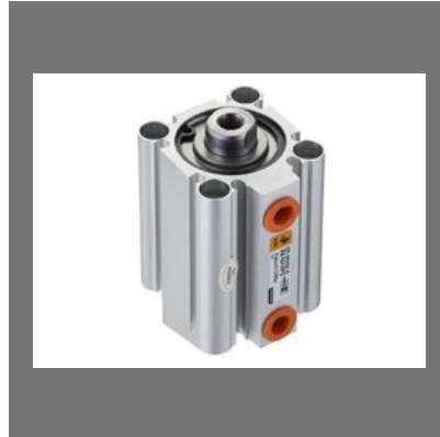
SQ series compact pneumatic cylinder