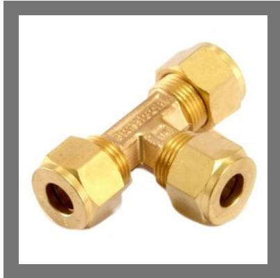
Olive Male Tee Assembly