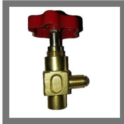
Brass Compressor Delivery Valve