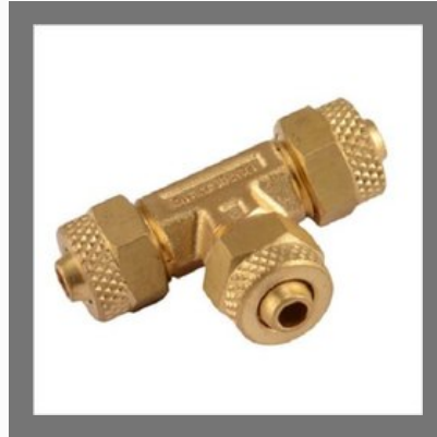
Equal PU Tee Assembly