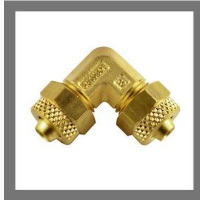
Equal PU Elbow