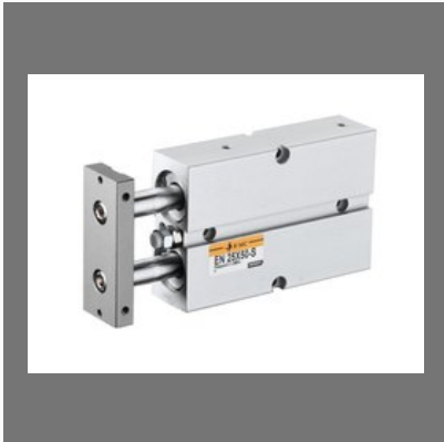
EN Series Double Piston Pneumatic Cylinder