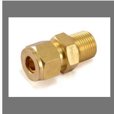
Olive Male Connector Assembly