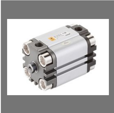
SE series compact pneumatic cylinder