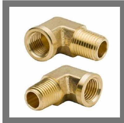
Brass Male Female Elbow