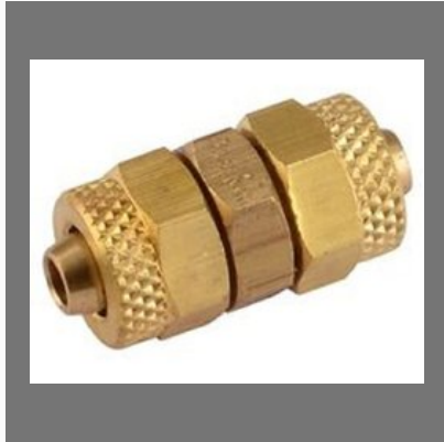
Brass Equal PU Connector