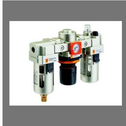
EI Series Air Source Treatment Unit