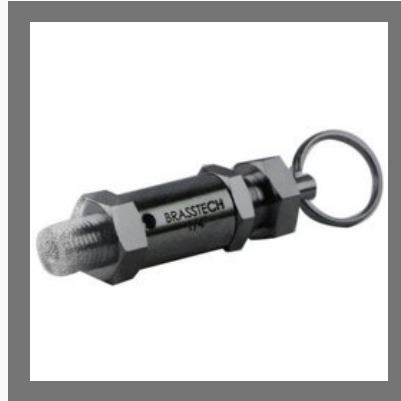
Brass Compressor Safety Valve