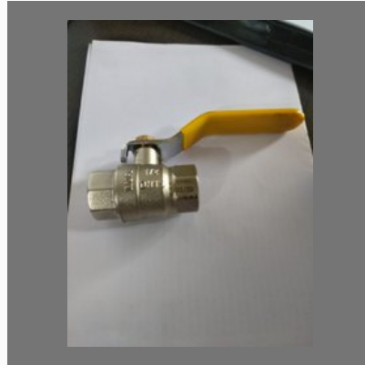
brass ball valve