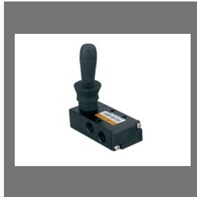
H Series Hand Push Valve