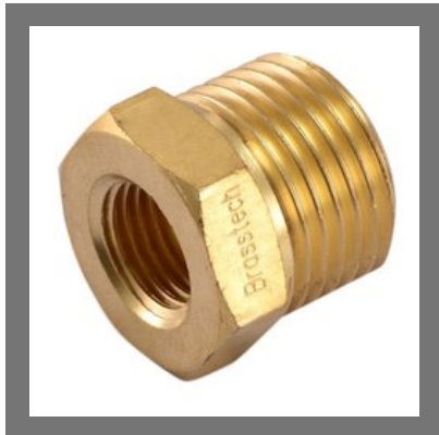
Brass Male Female Bush