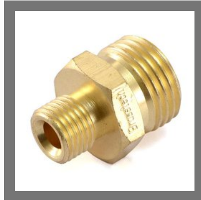
Brass Male Union