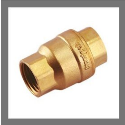
Non Return Valve Vertical