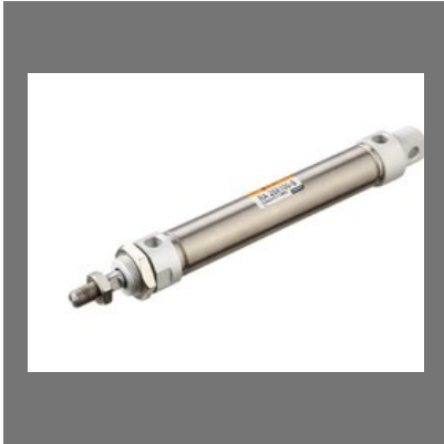
RA Series Mini Pneumatic Cylinder