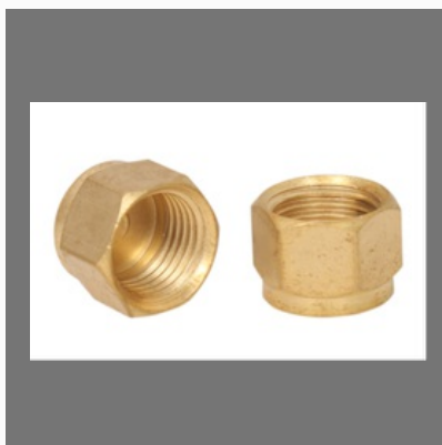
Brass Hex Dead Nut For Brass Pipe Fittings