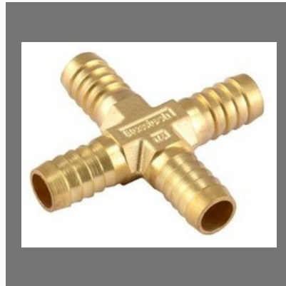
Brass Cross Joint Nipple For Hose Fittings