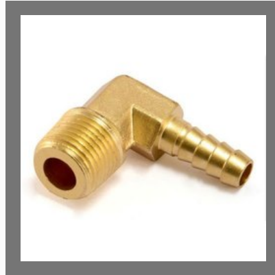
Brass Male Hose Elbow