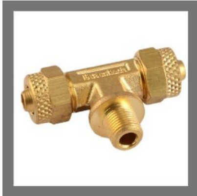
PU Tee Assembly