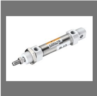
IA Series ISO6432 Mini Pneumatic Cylinder