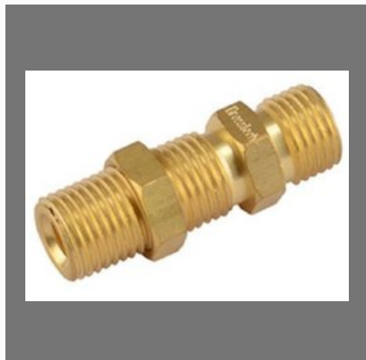
Brass Bulk Head Union For Brass Pipe Fittings