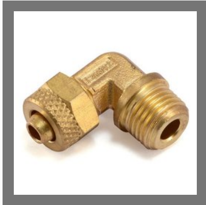
Brass Compression Elbow