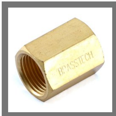
Brass Hex Socket