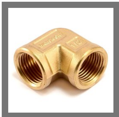
Brass Female Elbow