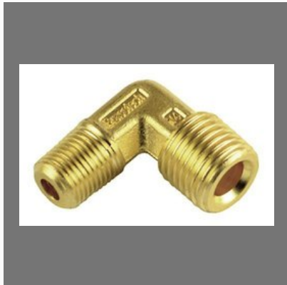
Brass Connector Male Elbow Tube OD X BSPT