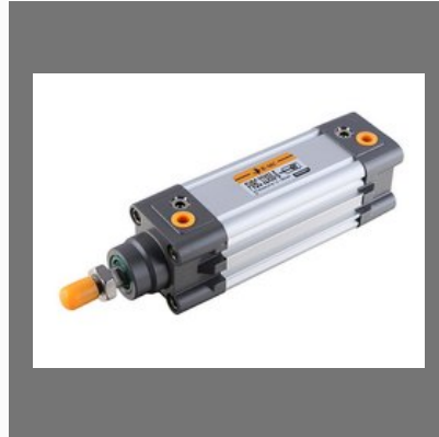
Square Air Cylinder