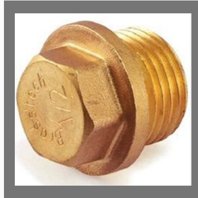
Brass Forging Plug