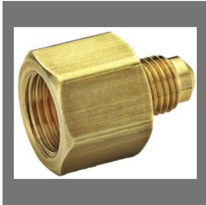
Male Female Brass Adaptor