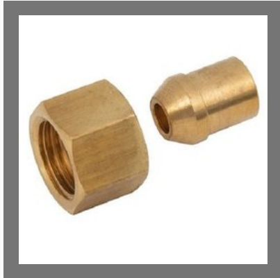
Brass Solder Nut Nipple Set For Hose Fitting