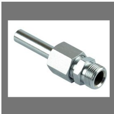
Brass Fountain Nozzle