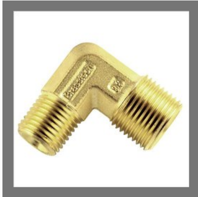
Brass Reducing Male Elbow