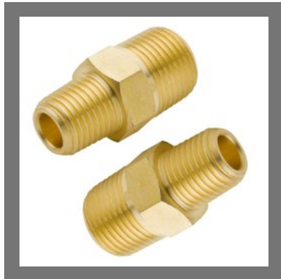
Brass Reducing Hex Nipple