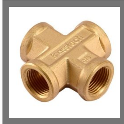
Brass Female Four Way Tee