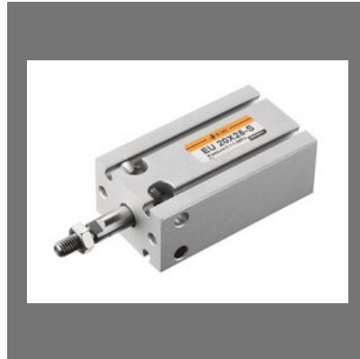
EU Series Free-Mounting Pneumatic Cylinder