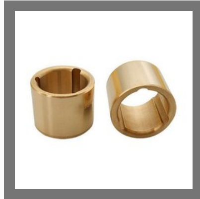
Round Brass Bush