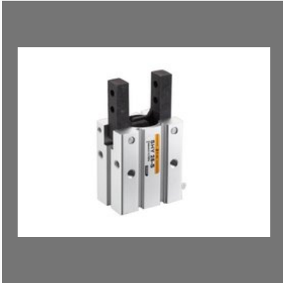
SHY Series Y Type Air Gripper