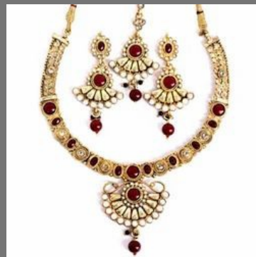
Bridal Costume And Jewellery