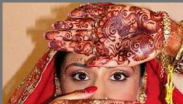
Bridal Costume And Jewellery