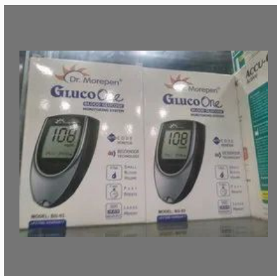
Blood Glucoae Monitoring System