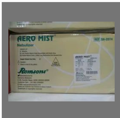
Nebulizers Medical Machine