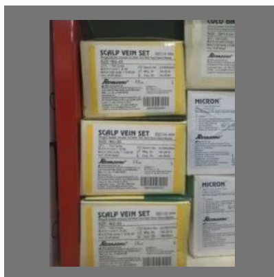
Scalp Vein Set