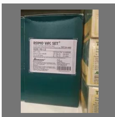
Romo Vac Set