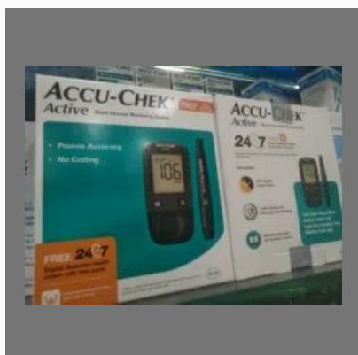
Accu Check Glucometer