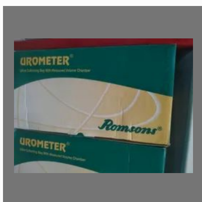
Urometer Urine Bag