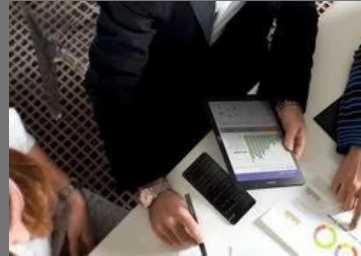
Samsung Mobility Solutions