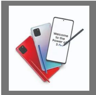
Samsung Note10 Lite