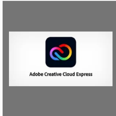
Adobe Express Software