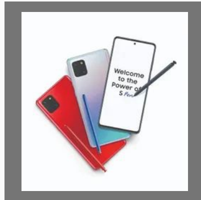
Samsung Note10 Lite