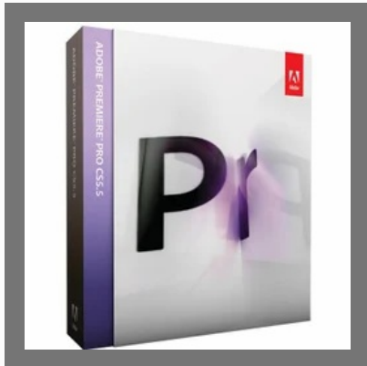
Adobe Premiere Pro Software