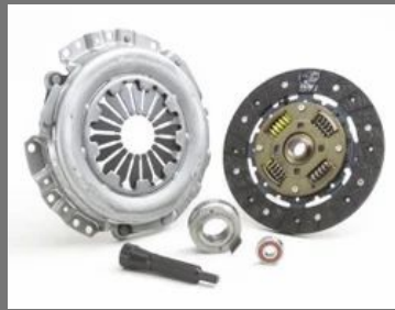
Part Machining Broaching Tool