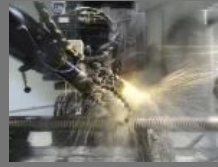
CNC Machining Services