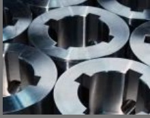
Production Broaching Tool