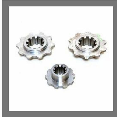
Clutch Plate Hubs