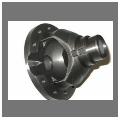
CNC Turning Broaching Tool