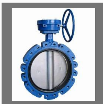
Lug Type Butterfly Valve