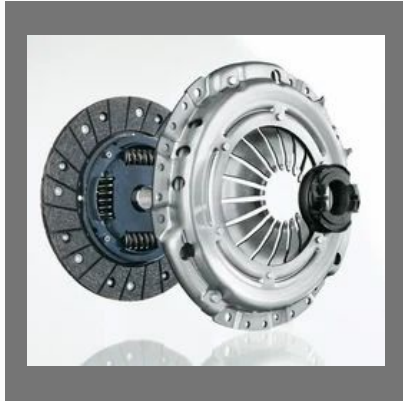
PHC Valeo Clutch Disc