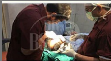
Double Chin Cosmetic Surger