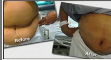
Tummy Tuck Or Abdominoplasty