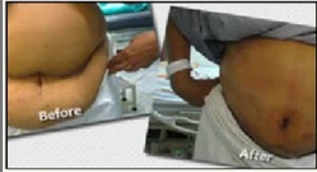
Tummy Tuck Or Abdominoplasty