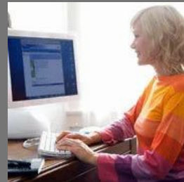
Foreign clients - Indian Opportunities