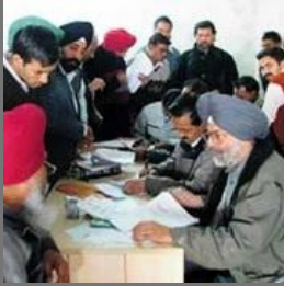
Service Tax Registration & Assessment Services