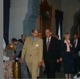
Registrations & Licenses In Foreign Trade Policy