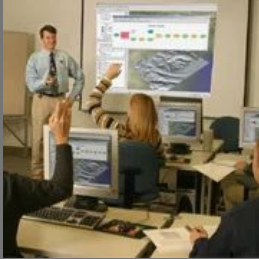
Indirect Tax Training Services