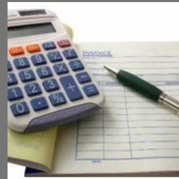
Custom Law & Applicable Regulations