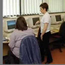
Tax Preparation & Reporting Services