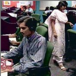
Outsourcing Consultancy Services