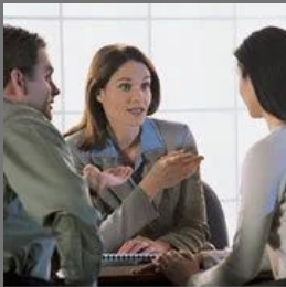
German VAT Refund