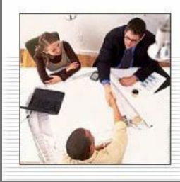
Excise Duty Consultancy Services