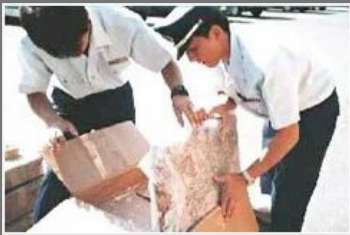
Tax Refund Policy Anywhere Across The Globe