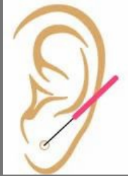
Piercing Beauty Services