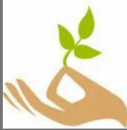
Mani-Pedi Beauty Services