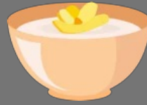
Skin Care Beauty Services