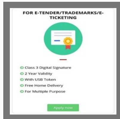
Class 3 Digital Signature Services