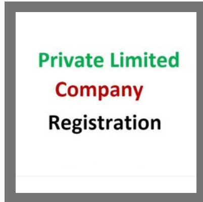
Private Limited Company Registration Service