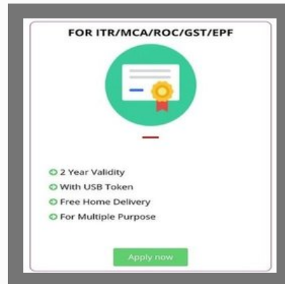
Digital Signature Certification Service