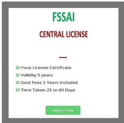
FSSAI Central License Service