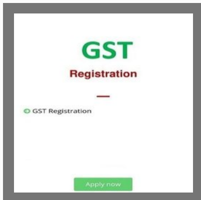
Gst Registration Service