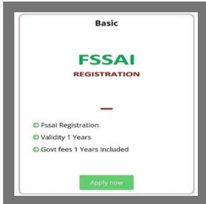
FSSAI Registration Service