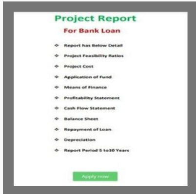
Pmegp Project Report