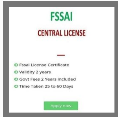
FSSAI Central License Service