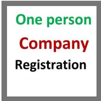
One Person Company Registration Services