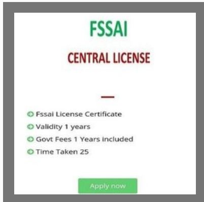
FSSAI Central License Service