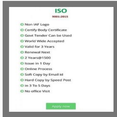
ISO 9001:2015 (Non IAF Certificate)