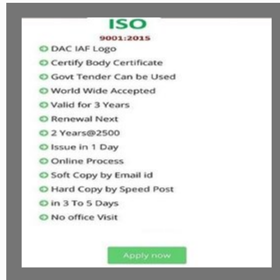
ISO 9001:2015 (DAC IAF Approved Certificate)