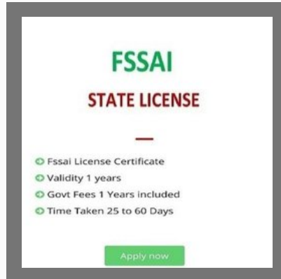
FSSAI Stae Licensing Services