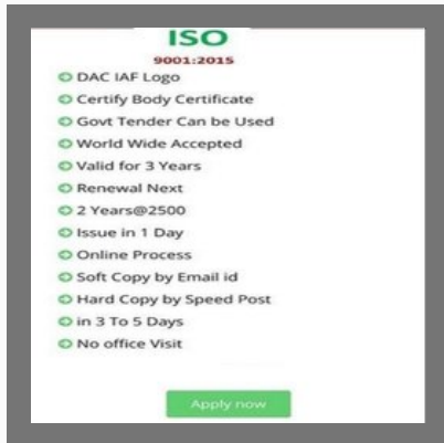
ISO 9001:2015 Certification Services