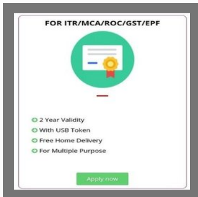
Dsc For DGFT