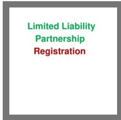
LLP Company Registration Service