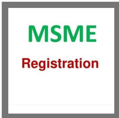
MSME Registration Consultancy Service