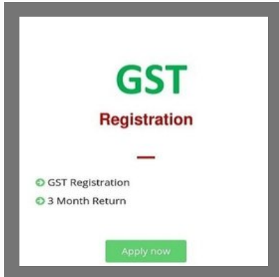
GST Return Filing Services