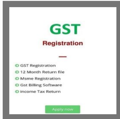
GST Consultant Service