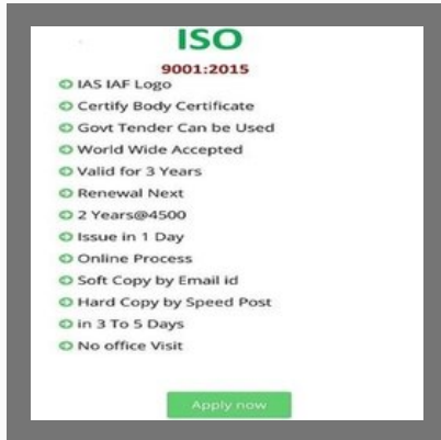
ISO 9001:2015(IAS, IAF Approved Certificate )