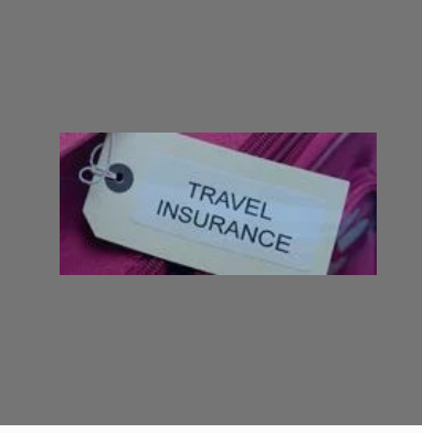
Travel Insurance tour