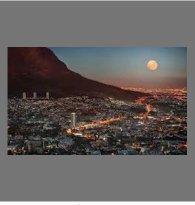
10D - 9HN SA Mauritius tour