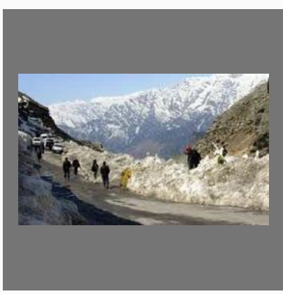
9D - 8HN Shimla Manali tour