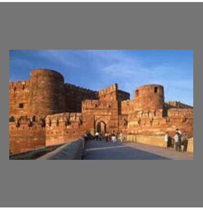
Rajasthan Marwad Tour