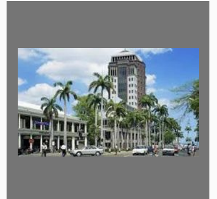
Mauritius With Dubai Tour