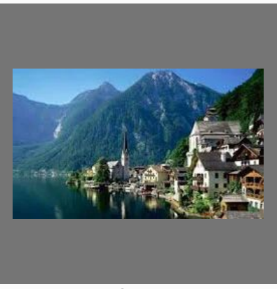
Italy Austria Swiss Tour