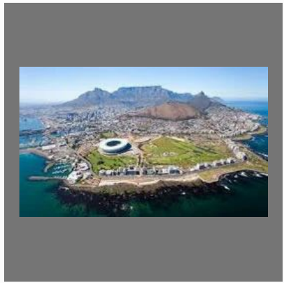
9d-8hn South Africa Tour