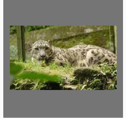
9D - 8HN Shimla Manali