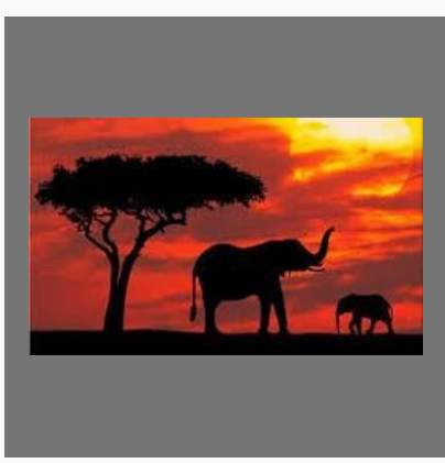
6d - 5hn Kenya Safari Tour