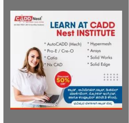
CREO Parametric Training