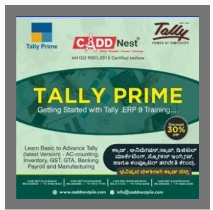
Tally Prime Training