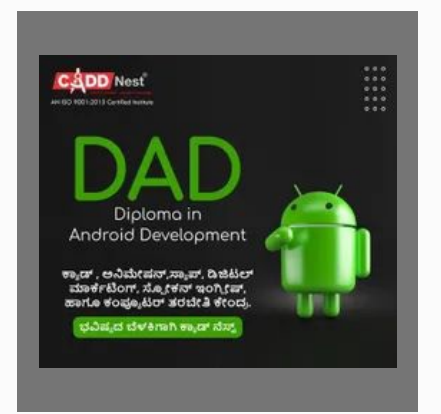
Diploma In Android App Developments