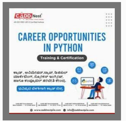
Python Training Courses

Professional Diploma In Digital Marketing