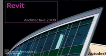
Revit Architecture Service