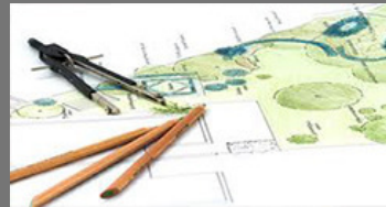
Civil CAD Service