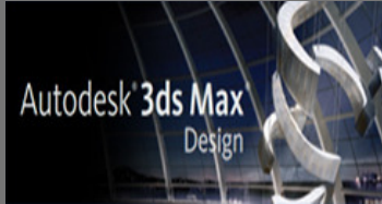
3ds Max Design Service