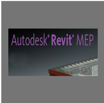
Revit MEP Service