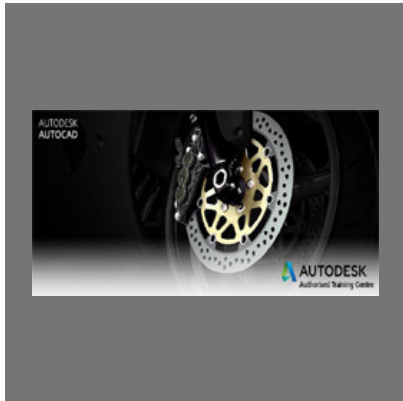
Autodesk AutoCAD Service