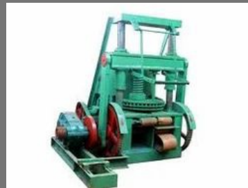
Briquette Press Machine