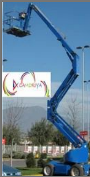
Articulating Boom Lift