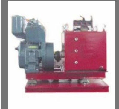
Engine Driven Power Pack