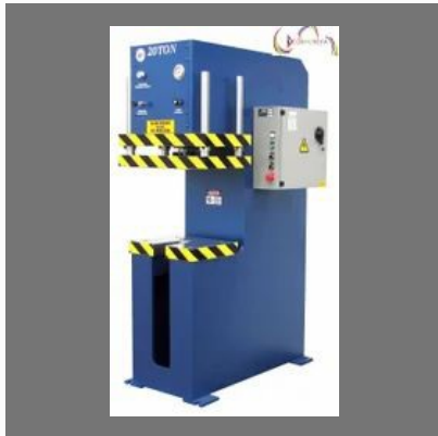
C Frame Hydraulic Press