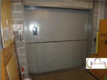
Material Handling Lift