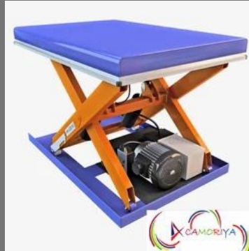
Scissor Lift Table