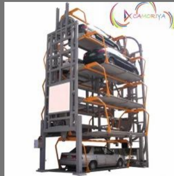
Rotary Car Parking System