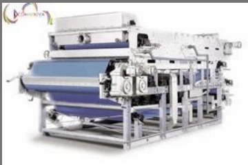
Press Belt Filter