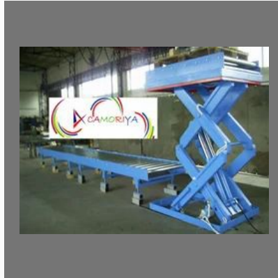
Hydraulic Scissor Lift