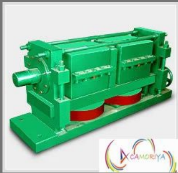
Box Shear or Vertical Shears