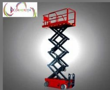
Self Propelled Scissor Lift