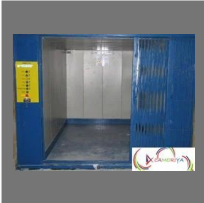
Goods Freight Elevator