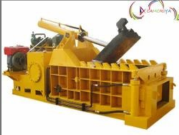
Scrap Baling Press