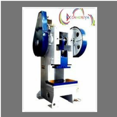
Mechanical Stamping Press