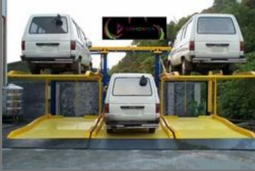
Puzzle Car Parking System