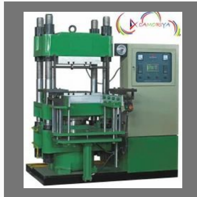
Rubber Moulding Press