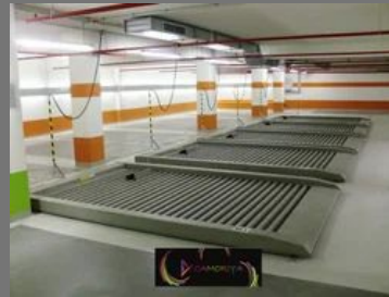
Car Parking Pallet System