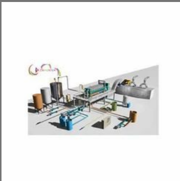
Liquid Separation System