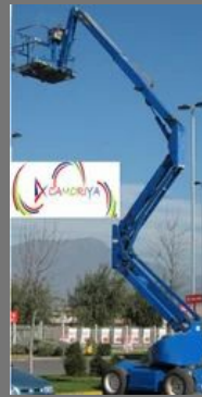
Articulating Boom Lift