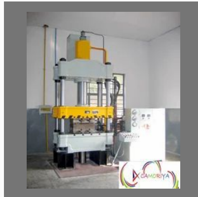
4 Column Type Hydraulic Press