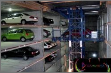
Fully Automatic Car Parking System