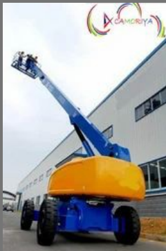
Telescopic Boom Lift