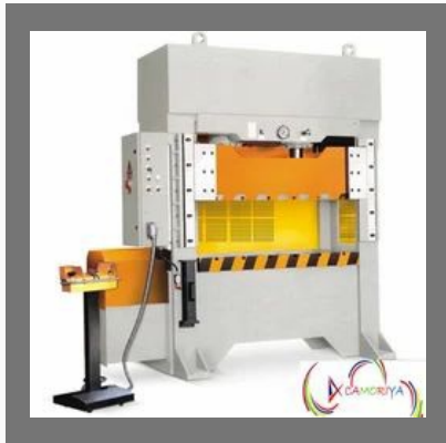
H-Frame Hydraulic Press