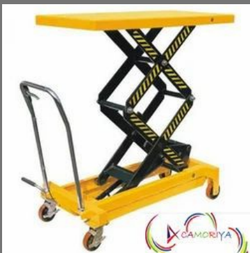
Scissor Lift Trolley