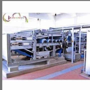
Belt Filter Press