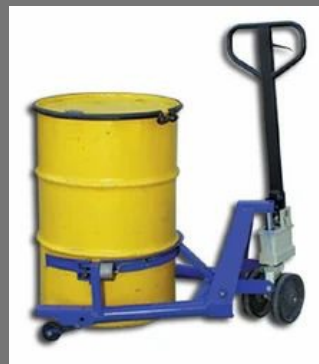
Drum Handling Equipment