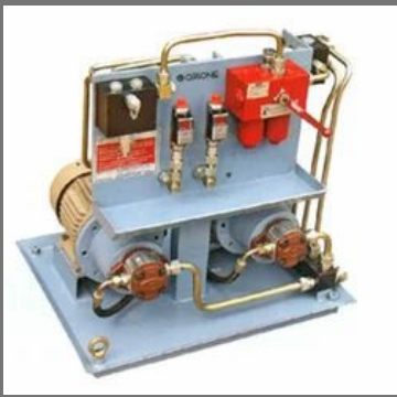
CNC Power Pack