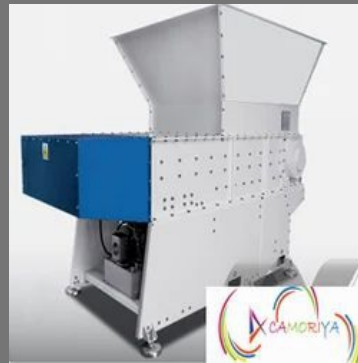
Pre Shredder or Rotary Shredder