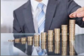
Bullion Intra Day