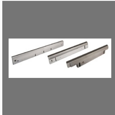
Work Rest Blade