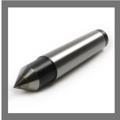
Carbide Center Drills