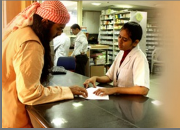
Multi Cuisine Service