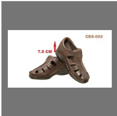
Brown Casual Elevator Mens Sandals for Extra Height