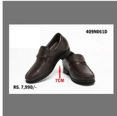
Causal Loafers Elevator Shoes In Brown With Touch Of Stylish