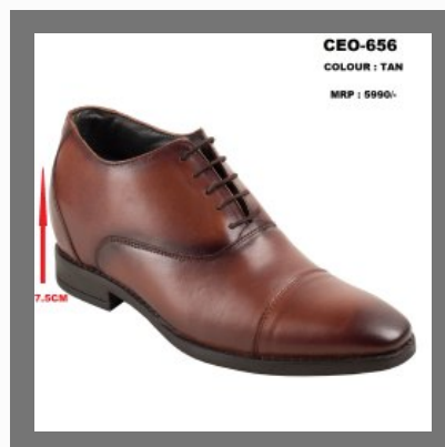
Celby Tan Dual Shade Oxford Formal Height Increasing Leather Shoes for Men