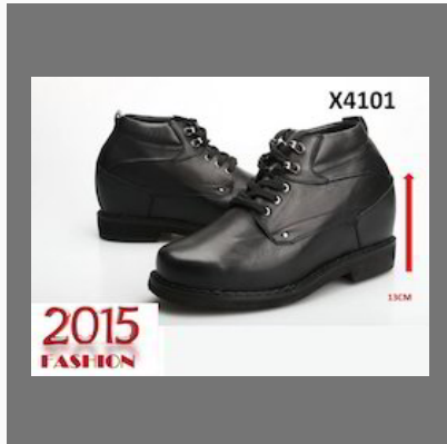
High Heel Men Shoes 13 Centimetres