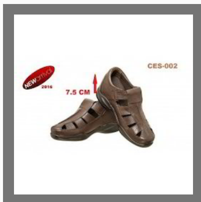
Height Increasing Brown Casual Elevators Sandals