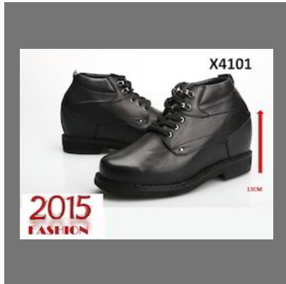
13cm Extra Height Increasing Elevator Shoes