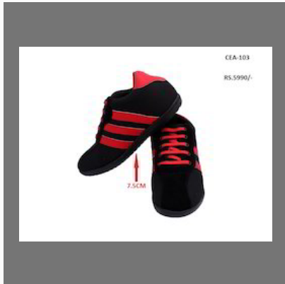
Red & Black Sporty Look Height Increasing Elevator Shoes