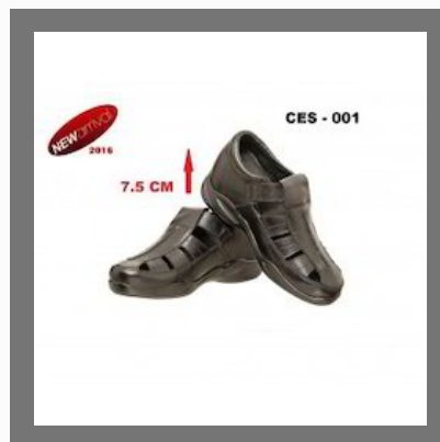
Height Increasing Black Casual Elevators Sandals