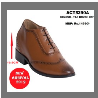
Tan Brush Off Formal Wingtip Brogue Height Increasing Leather Shoes for Men