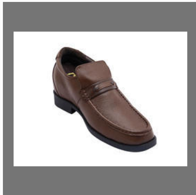
Causal Loafers Elevator Shoes in Brown with Touch of Stylish Look