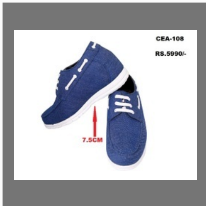
Blue Sporty Look Height Increasing Elevator Shoes