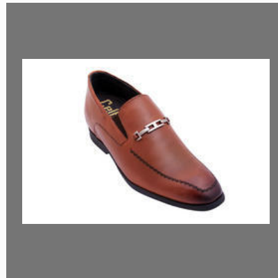
Celby Formal Loafer Elevator Height Increasing Shoes in Tan with Touch of Stylish Look