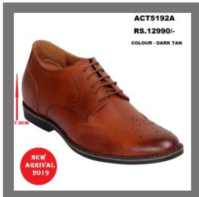
Dark Dual Shade Tan Formal Wingtip Brogue Height Increasing Leather Shoes for Men