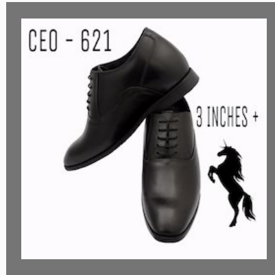
Classic Plain Crafted Elegance Height Shoes