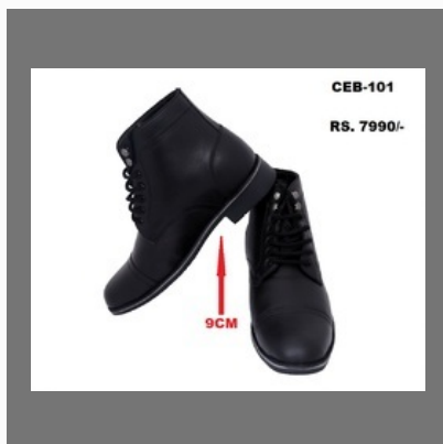
Celby Sharp Black Color Boot With Side Zipper Hidden Heel Height Increasing Elevator Shoes For Men