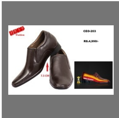
Slip On Brown Height Increasing Elevator Shoes