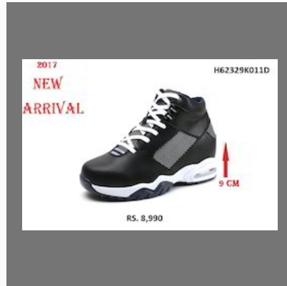
Sporty Look Black Elevator Shoes