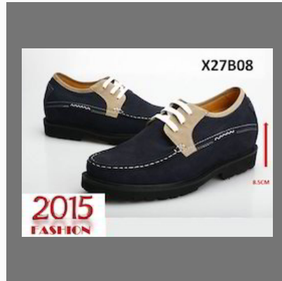
Height Increasing Men Shoes Fashion 2015