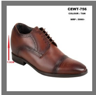
Celby Tan Dual Shade Brogue Formal Height Increasing Leather Shoes for Men