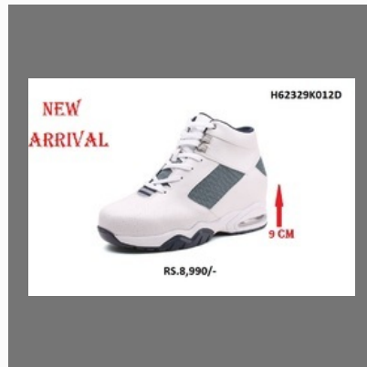
Sporty Look White Elevator Shoes With 9 Cm Height