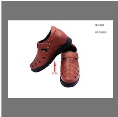
Celby Genuine Leather Height Increasing Sandal