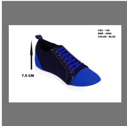
Blue Sporty Look Height Increasing/Elevator Shoes