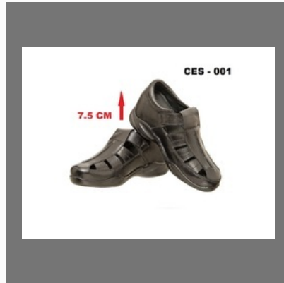
Black Casual Elevator Mens Sandals for Extra Height