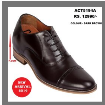
Dark Brown Formal Oxford Brogue Height Increasing Leather Shoes for Men