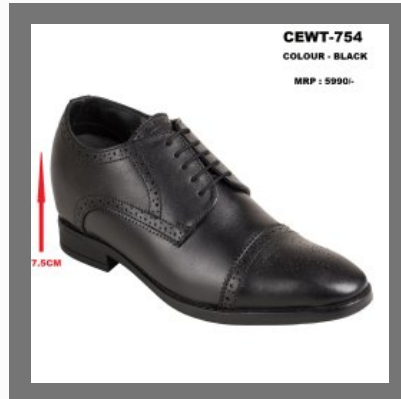
Celby Black Brogue Formal Height Increasing Leather Shoes For Men