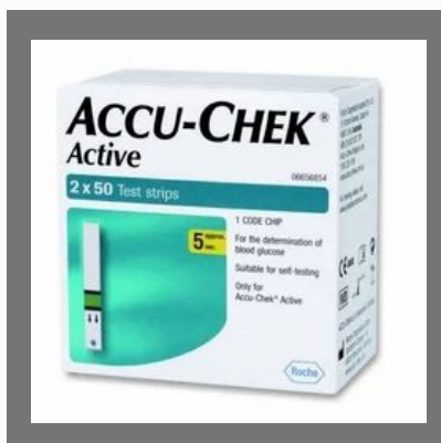
Accu Chek Active 100 Test Strips