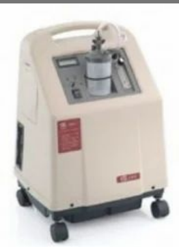
Yuwell 7F-5 Mini Oxygen Concentrator