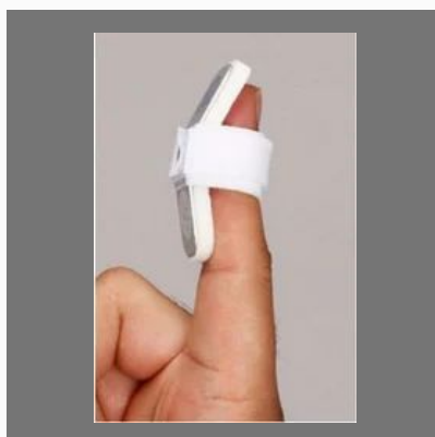
Mallet Finger Splint Machine