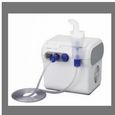
Omron Ne C29 Compressor Nebulizer Machine