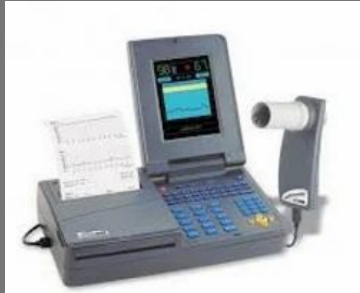
Mir Spirolab Iii Spirometer Machine