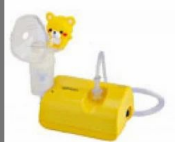
Omron Compressor Nebulizer Machine