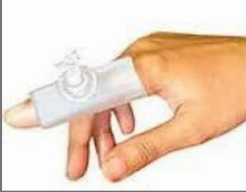
Activeair Air Inflated Orthopaedic Splints Finger Splints