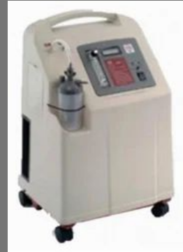
Yuwell Oxygen Concentrator