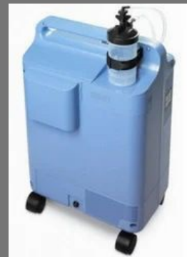
Phillips Everflo 5lpm Oxygen Concentrator Machine