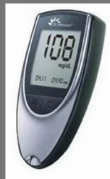
Dr Morepen Blood Glucose Meter Bg 03 Device