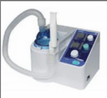
Omron Ultrasonic Nebulizer Machine