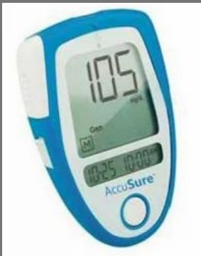
Accu Sure Blood Glucose Meter Device