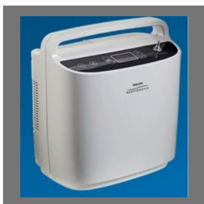
Philips Simply Go Portable Oxygen Concentrator Machine