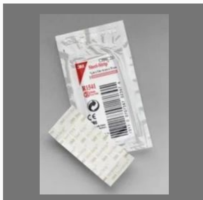
Steri Strip R1541