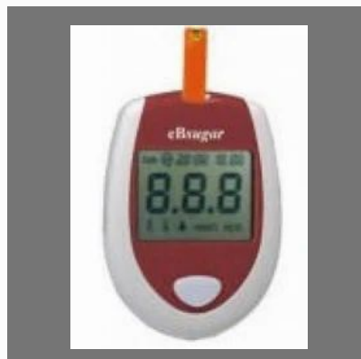
Ebsugar Glucose Monitor Device