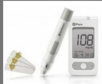
Medical Mylife Pura Glucometer