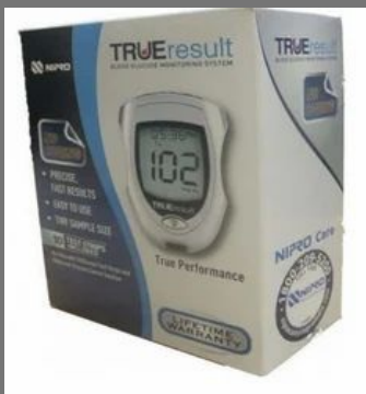
Nipro Trueresult Medical Kit