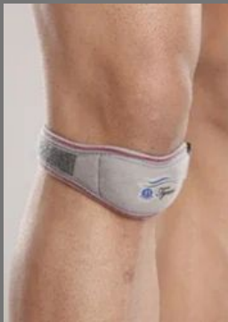
Medical Knee Support