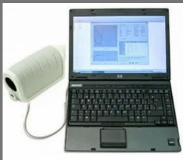
Contec SPM Spirometer Machine