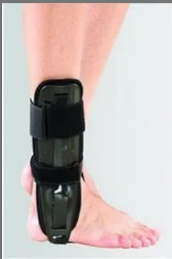
Ankle Splint Air Pad