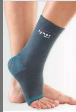
Anklet Comfeel Single