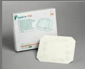
Tegaderm 3587 Dressing