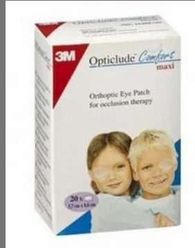
3m Opticlude Orthoptic Eye Patch 1539 Regular