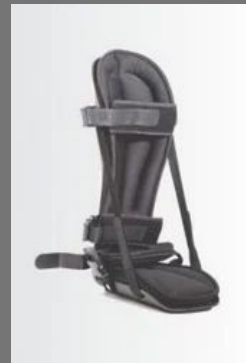
Foot Drop Splint