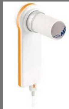
Mir Minispir Spirometer Oximeter