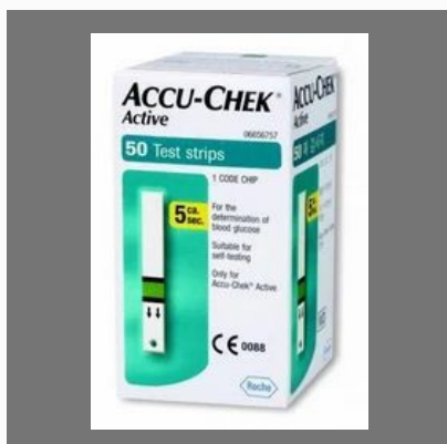
Accu Chek Active 50 Test Strips