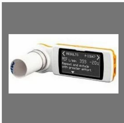
Mir Spirodex Spirometer Oximeter