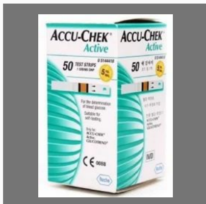
Accu Chek Active Test Strips