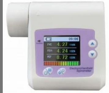
Contec Handheld Sp10 Spirometer Machine