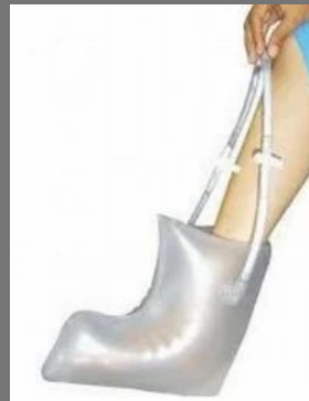
Air Inflated Orthopaedic Splints Foot And Ankle Splints