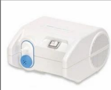
Omron Compressor Nebulizer