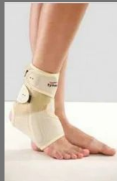
Ankle Support Neo