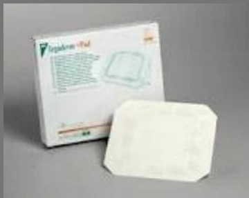
3m Tegaderm 8584 Dressing