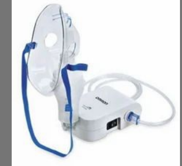
Omron Compressor Nebulizer Medical Machine