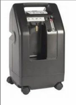
Devilbiss Compact 525 Oxygen Concentrator Machine