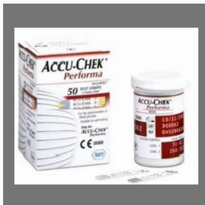
Accu Chek Performa Test Strip Box Of 50