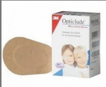
3m Opticlude Orthoptic Eye Patch 1537 Junior