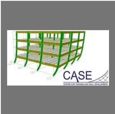
Training on Analysis and Design of Structures