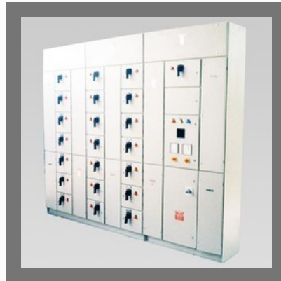
LT Panel Board