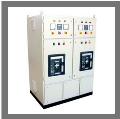
Control Panel Board