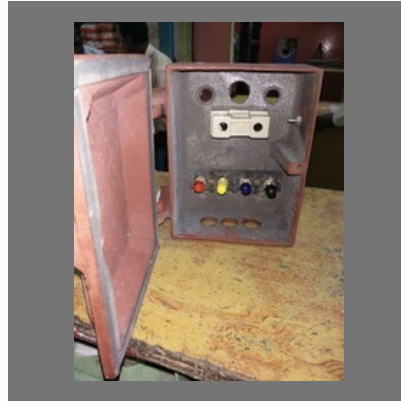
Casting Pole Box