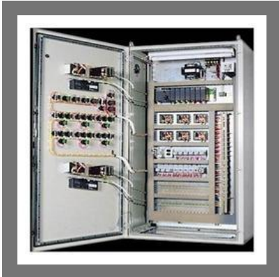
Electric Control Panel