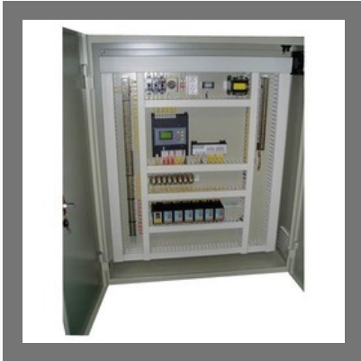
DDC Electrical Panels