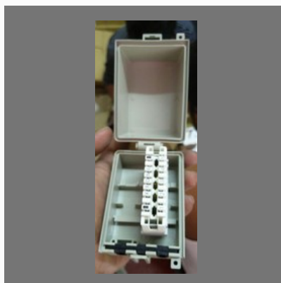
5pair Telephone Box