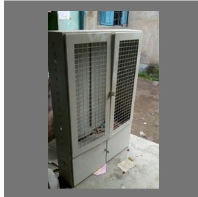
Meter Board Panel