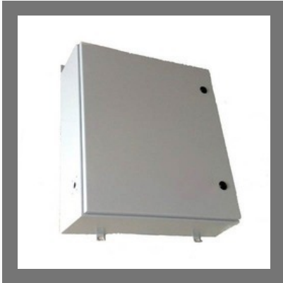
Electrical Distribution Box