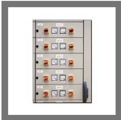
Electrical Cubicle Panel Board