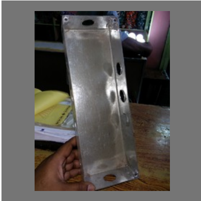
G.I Conceal Box 12x4x2.