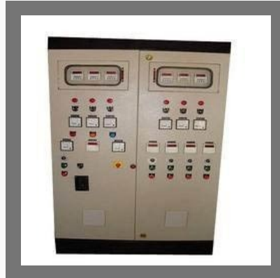
Machinery Control Panel