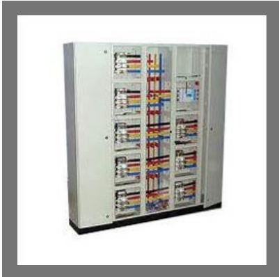
Wire Control Panel