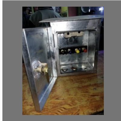
Outdoor Pole Box