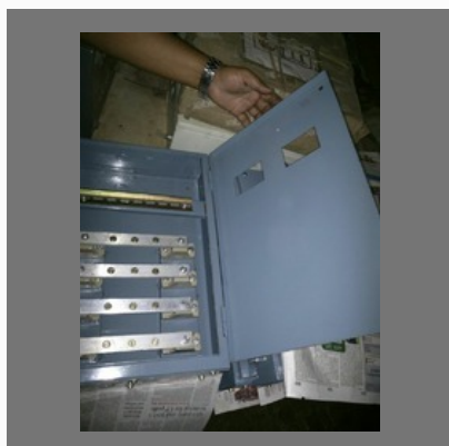
Busbar Chamber Box With Copper And Alluminium Bar