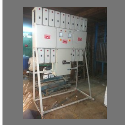
Angle Frame Control Panel