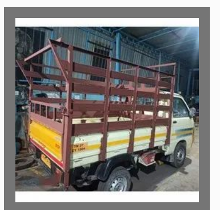
Mild Steel Automobile Bodies