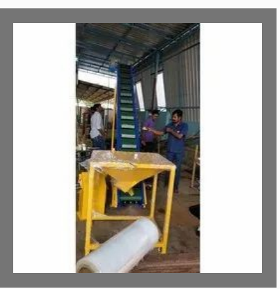
Loading Conveyor System