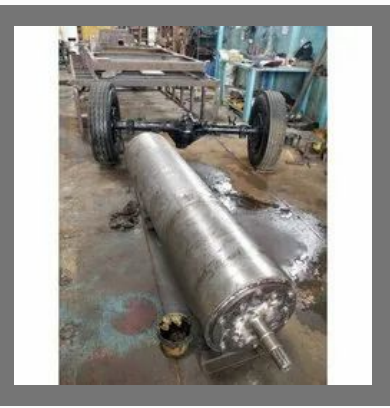
Coir Milling Machine