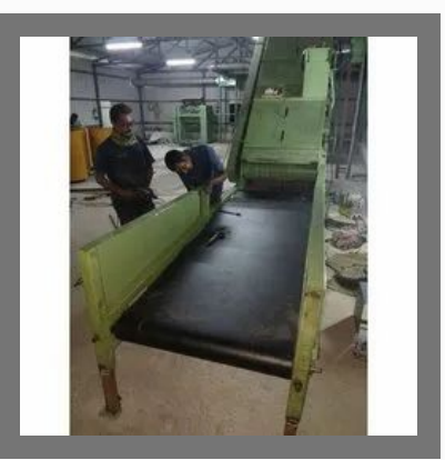
Mild Steel Loading Conveyor System