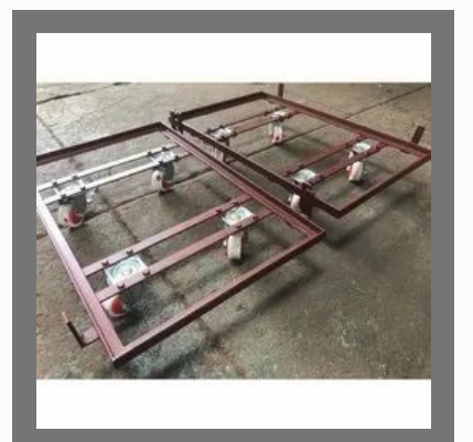
Mild Steel Platform Trolley