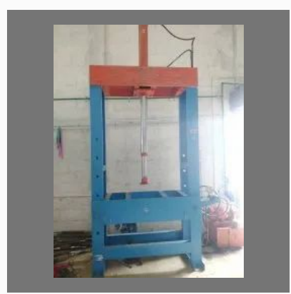
Hydraulic Power Press Machine