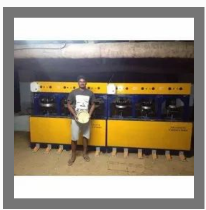
Areca Leaf Plate Making Machine