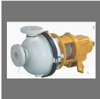
Self Priming Pumps