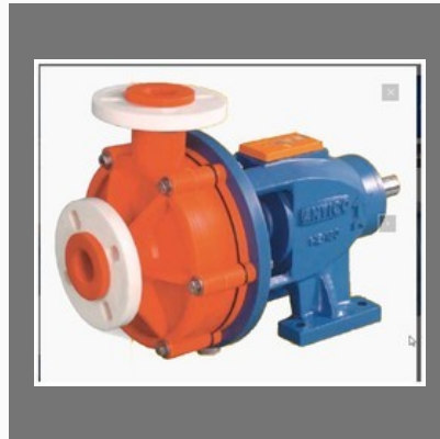
Horizontal Pumps HE Series