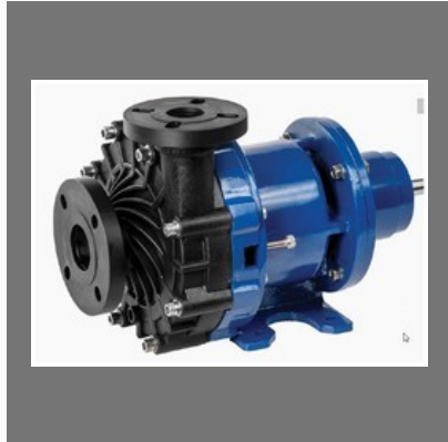
Mag Drive Pumps