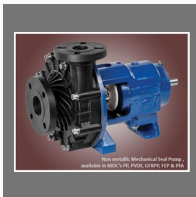
Non Metallic Mechanical Seal Pump