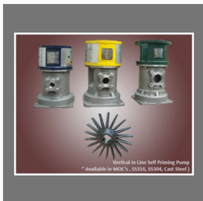
Vertical In Line Self Priming Pump