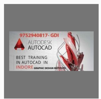
Autocad Training In Indore