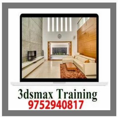
Autodesk 3ds Max Training INDORE