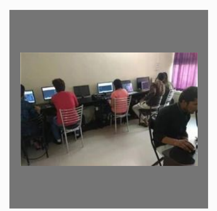
Mechanical Cad Computer Training Institutes