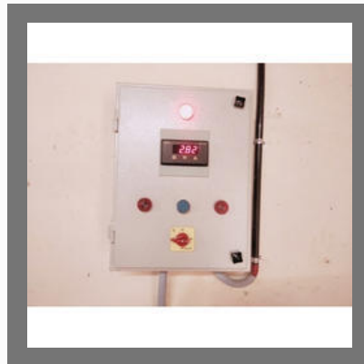
Ultrasonic Level Transmitter