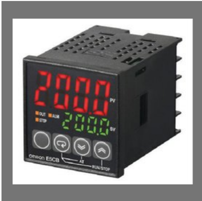
Omron E5CB Temperature Controller