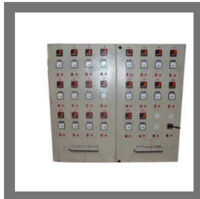
Electric Control Panel