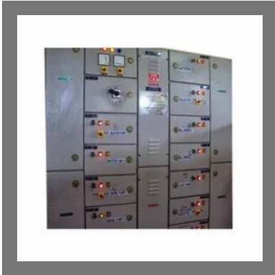
Control Panel Board