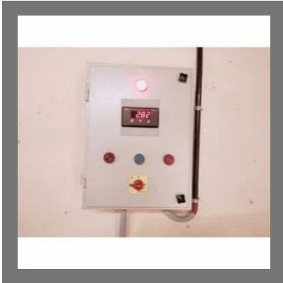
Ultrasonic Level Transmitter