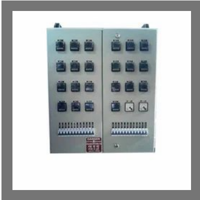
Hot Runner Temperature Controller