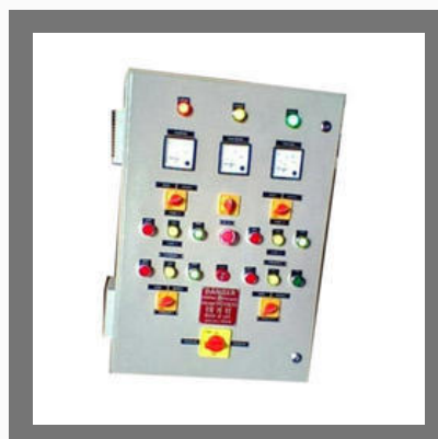
Submersible Pump Controller