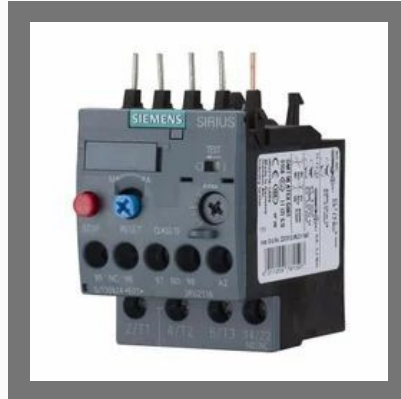
Thermal Overload Relay