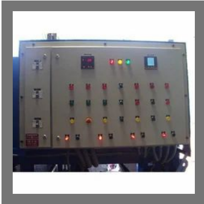
Hydraulic Power Pack Electrical Control Panel