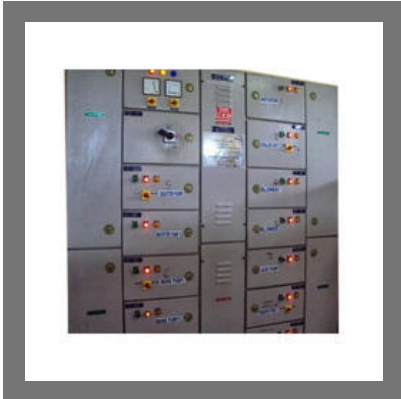
Control Panel Board