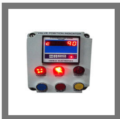
Valve Position Indicator