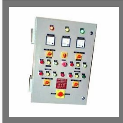
Submersible Pump Controller