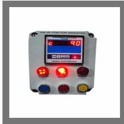
Valve Position Indicator