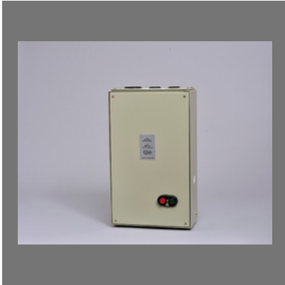
Star Delta Starter Panel