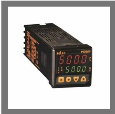
PID/On-Off Digital Temperature Controller