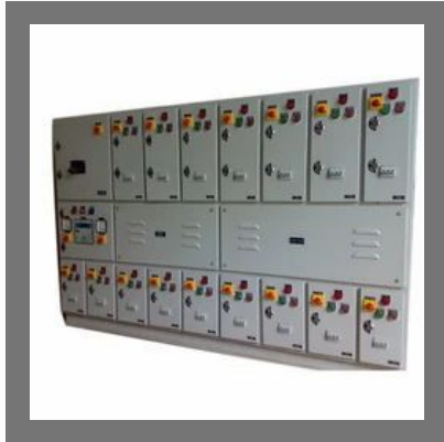
Motor Control Center Panel