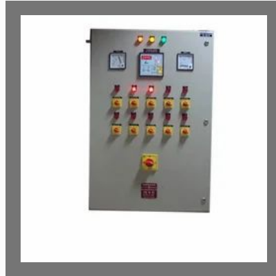
Power Factor Control Panel