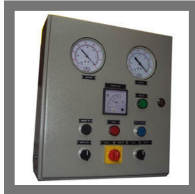
Plate Lifting Electrical Control Panel