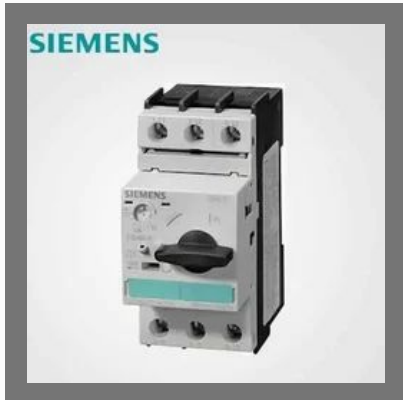
MPCB - Motor Protection Circuit Breaker