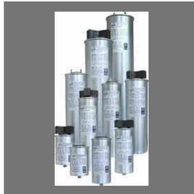
Power Factor Correction Capacitors