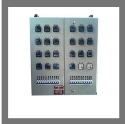
Hot Runner Temperature Controller