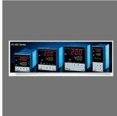
Universal PID Temperature Controller