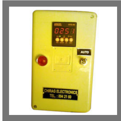
Automatic Light Switching Control Panel