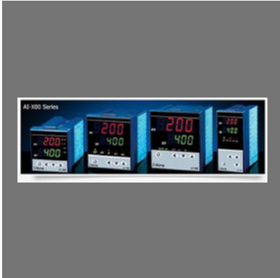
Universal PID Temperature Controller