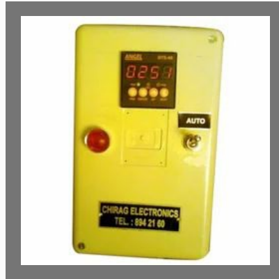
Automatic Light Switching Control Panel