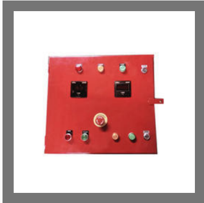
Fire Fighting Pump Control Panel