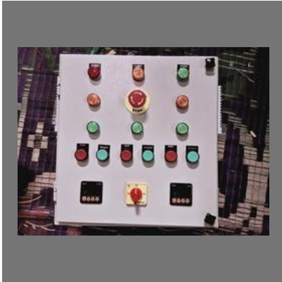
Motor Control Panel