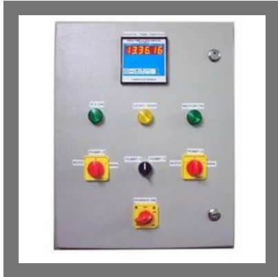
Automatic Water Level Controller