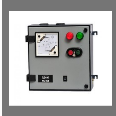
Submersible Pump Control Panel