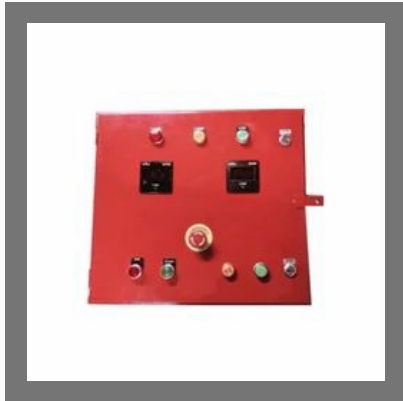
Fire Fighting Pump Control Panel