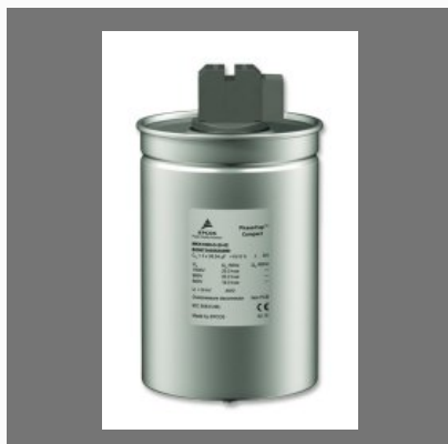
Power Factor Correction Capacitors