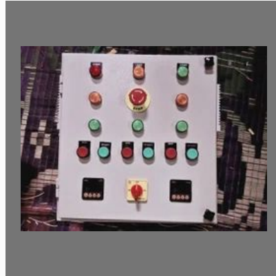
Motor Control Panel