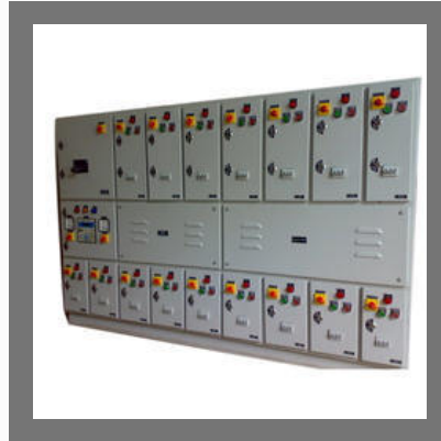
Motor Control Center Panel