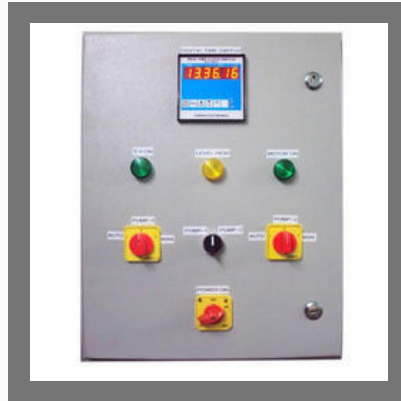
Automatic Water Level Controller