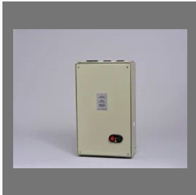
Star Delta Starter Panel