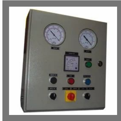
Plate Lifting Electrical Control Panel