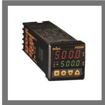
PID/On-Off Digital Temperature Controller