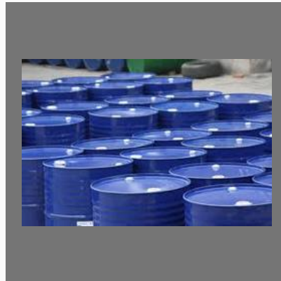
Tetra Hydro Furan