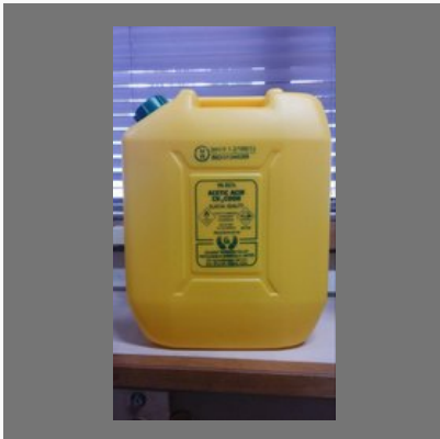
Glacial Acetic Acid