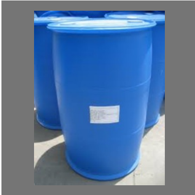
Dimethyl Sulfoxide (DMSO)