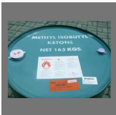
Methyl Isobutyl Ketone