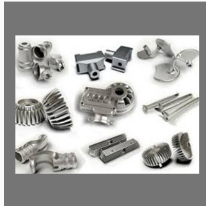
Pressure Die Casting Components