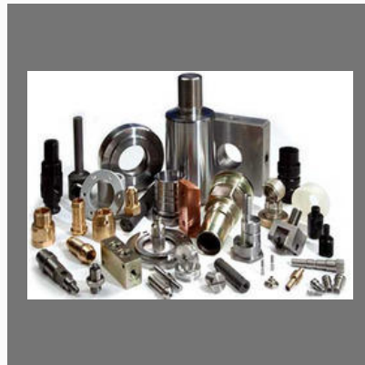
High Precision Machining Components