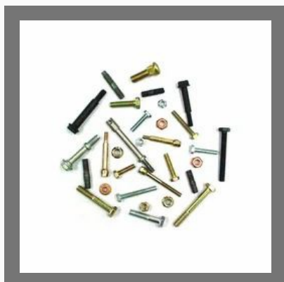
Metal Bolt And Nuts