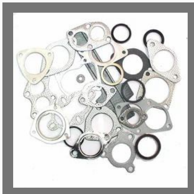
Non Asbestos Gaskets