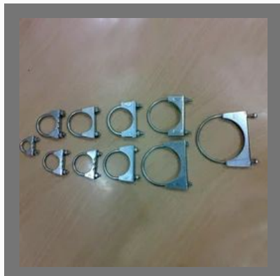
Metal U Clamps