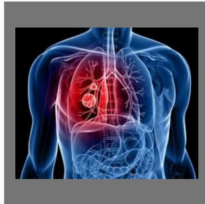
Cardiothoracic and Vascular surgery