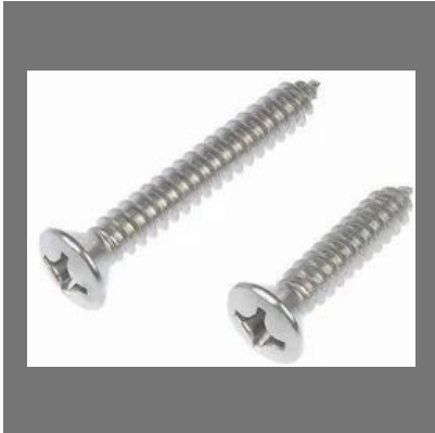
Self Tapping Screws