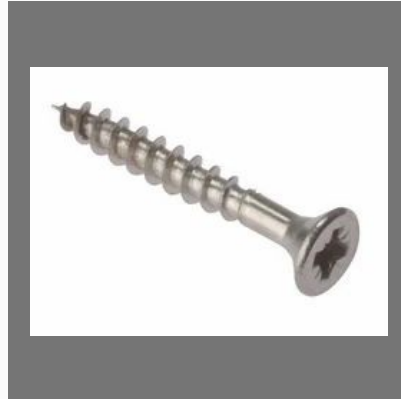
Stainless Steel Screw