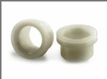
Transformer Nylon Bush