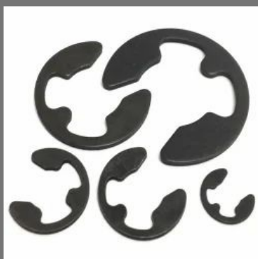
Circlip E Lock