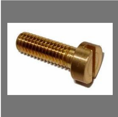
Brass Fillister Head Screw