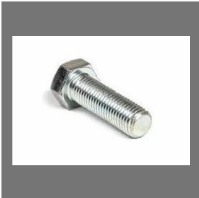
Mild Steel Hex Bolt