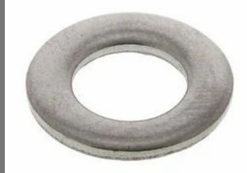
Stainless Steel Plain Washer