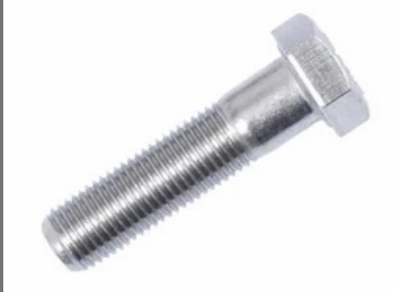
Stainless Steel Hex Bolt