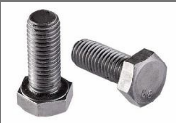
Stainless Steel Hex Bolt