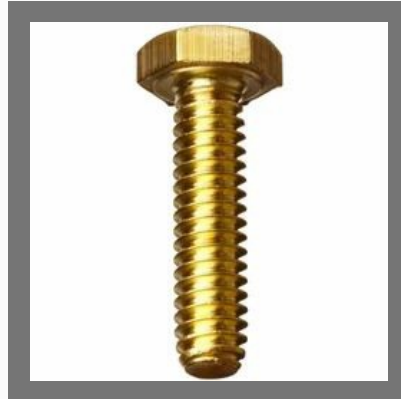
Brass Hex Bolt