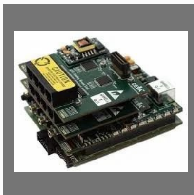
Outsourced EDA And ESL Tool Development Solution