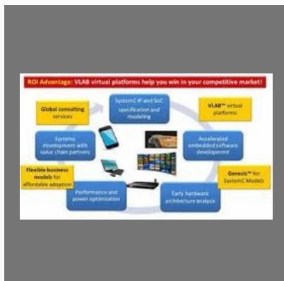
Systemc Model Library Service