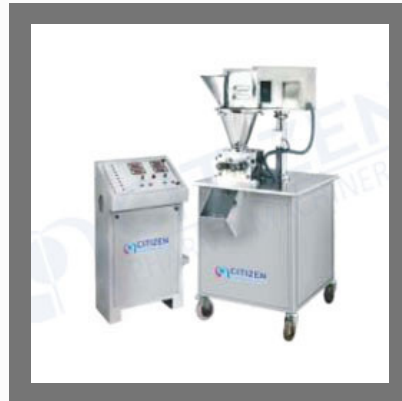
Lab Model Roll Compactor