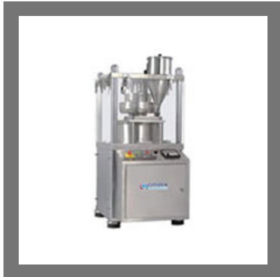
R&D Lab Press cGMP