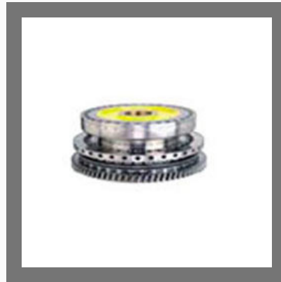
Pharmaceutical Machine Turret