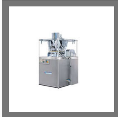
Double Sided Rotary Tableting Machine CGMP