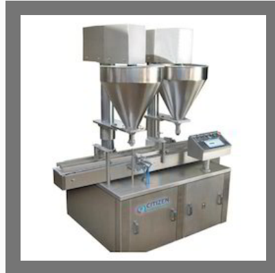
Weigh Metric Auger Powder Filling Machine