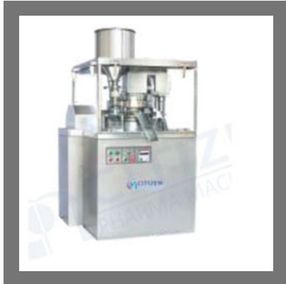
Single Rotary Tablet Press Machine cGMP