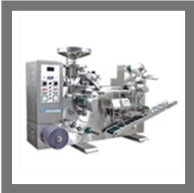
Blister Pack 300 Machine cGMP