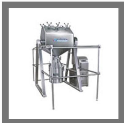
Octagonal Blender GMP