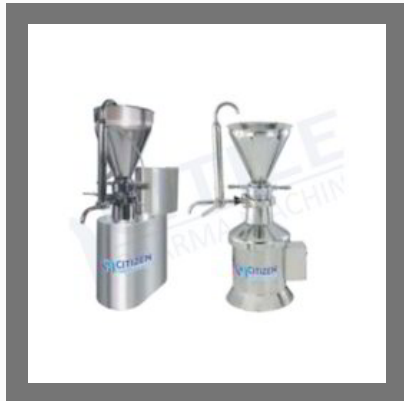
Colloid Mill cGMP