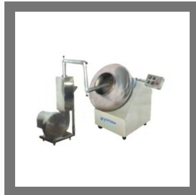
Coating Machine cGMP