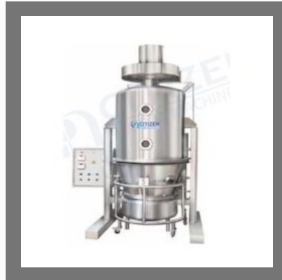
Fluid Bed Dryer cGMP