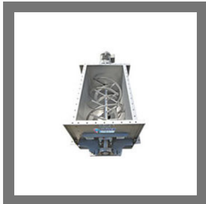
Ribbon Blender cGMP