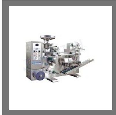
Blister Pack Machine cGMP