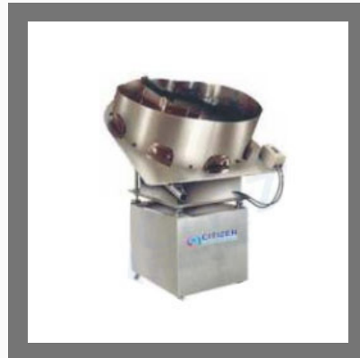
Tablet Counter Machine cGMP