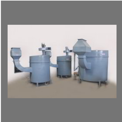
Vertical Wet Scrubber