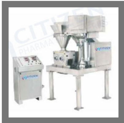
Roll Compactor Machine