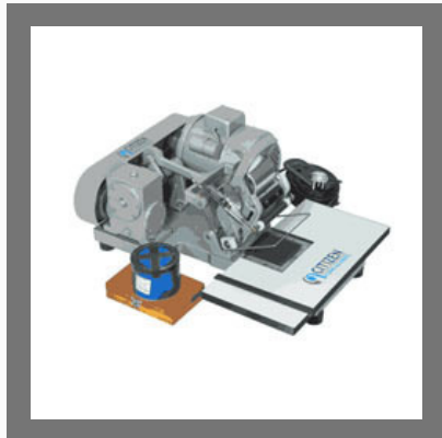
Motorised Operated Batch Printer