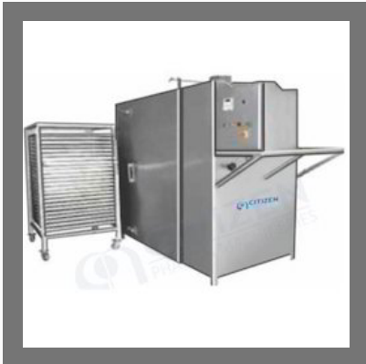
Tray Dryer cGMP