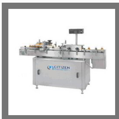
Automatic High Speed Labeling Machine cGMP