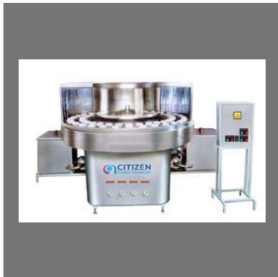
Rotary Bottle Washing Machine cGMP