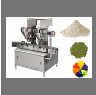
Weigh Metric Auger Powder Filling Machine