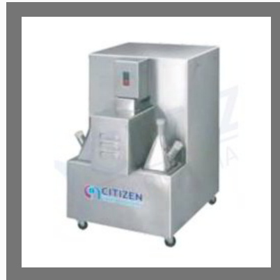
Dust Extractor Machine cGMP