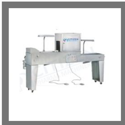
Tablet Inspection Machine cGMP