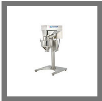
Multi Mill cGMP