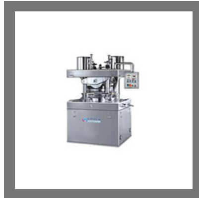
High Speed Tablet Press cGMP