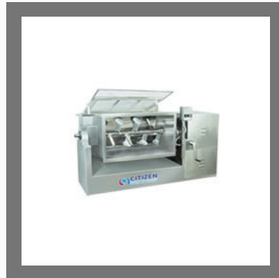
Mass Mixer cGMP