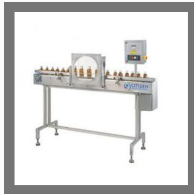
Online Bottle Visual Inspection Machine cGMP