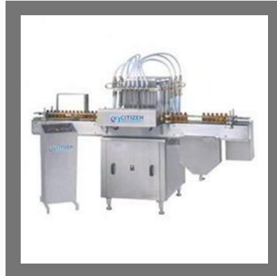
Automatic Volumetric Liquid Filling Machine cGMP