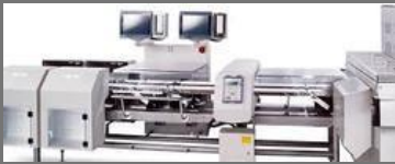
Quality System Equipments