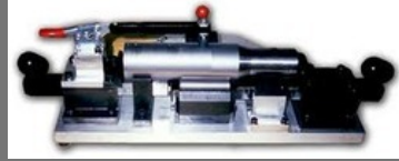
Reverse Eng Equipments