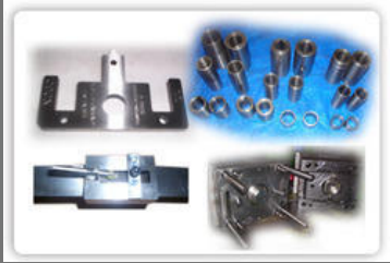
Aluminum Pressure Die Casting