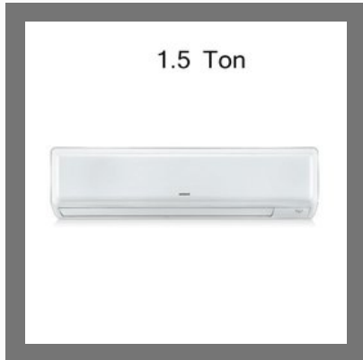
1.5 Ton Hitachi Split Air Conditioner