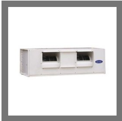
3 Ton Carrier Ductable Air Conditioner