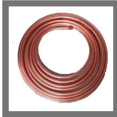
Air Conditioner Copper Pipe