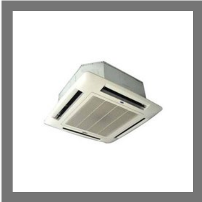
2 Ton Cassette Air Conditioner