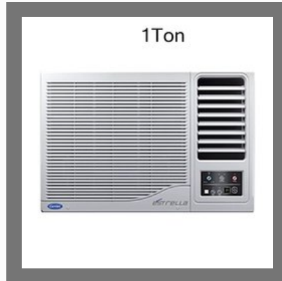
1 Ton Carrier Window Air Conditioner