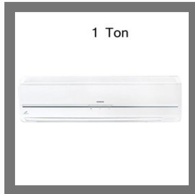
1 Ton Hitachi Split Air Conditioner