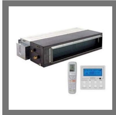
5 Ton Carrier Ductable Air Conditioner