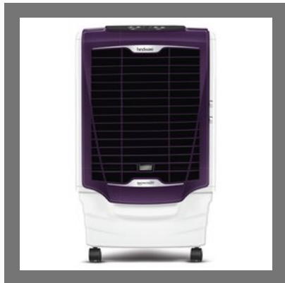
Hindware Air Cooler