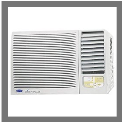
2 Ton Carrier Window Air Conditioner