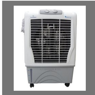
Crompton Air Cooler