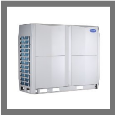
5 Ton Carrier VRF