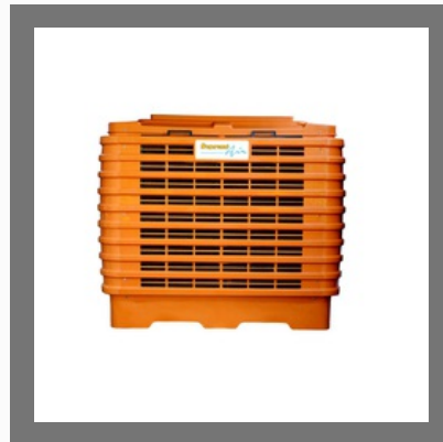
Supremo Evaporative Air Cooler