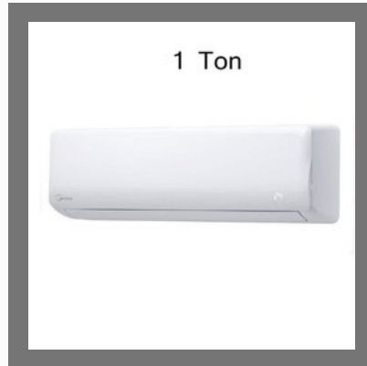
2.5 Ton Carrier Split Air Conditioner