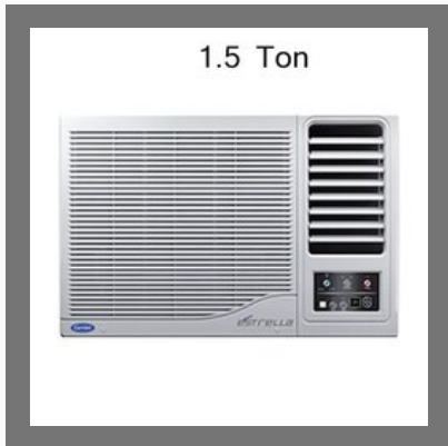
1.5 Ton Carrier Window Air Conditioner