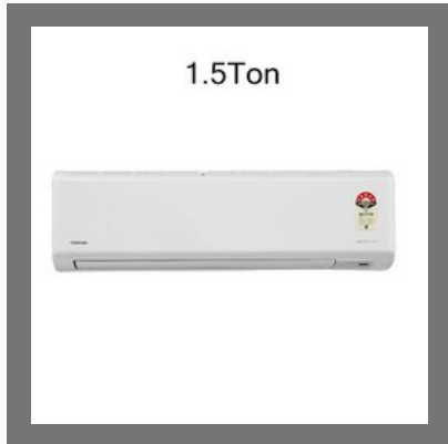
1.5 Ton Toshiba Split Air Conditioner