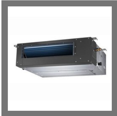
8.5 Ton Carrier Ductable Air Conditioner