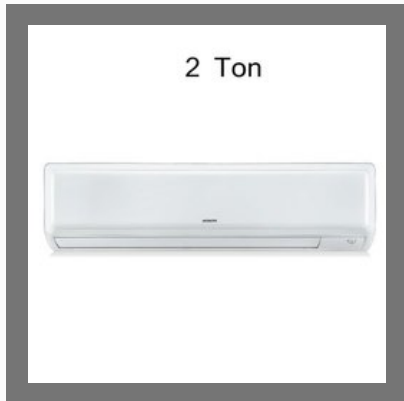
2 Ton Hitachi Inverter Split Air Conditioner