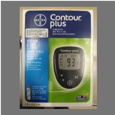
Blood Pressure Equipment