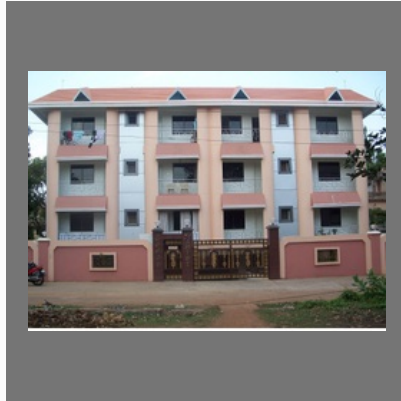
Sanoo Hamlet Completed Project