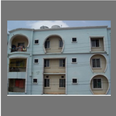
Versa Plaza Completed Project