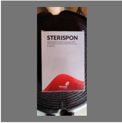
Sterispon Absorbable Gelatin Sponge