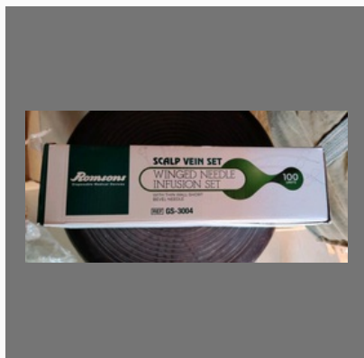
Winged Needle Infusion Kit