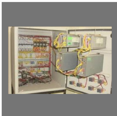
Relay Based Panel