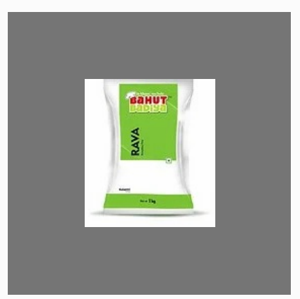
Rava Semolina Fine