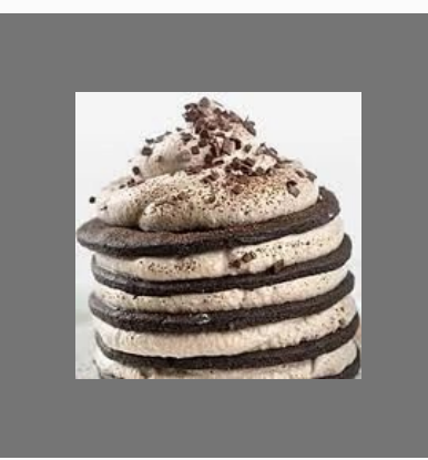
Wafer Flour For Wafer & Wafer Biscuits