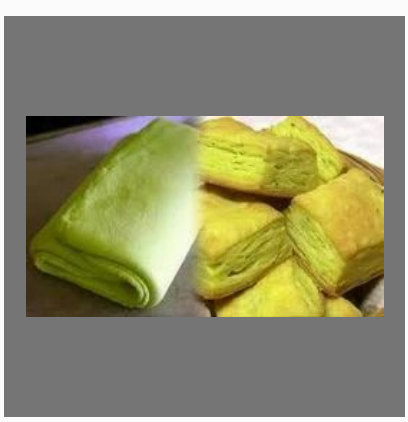
Khari Flour For Khari (Puffs)