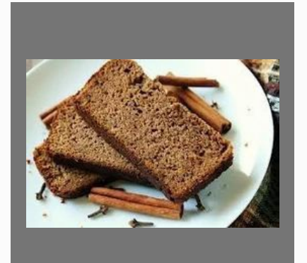
Bread Flour For Various Breads