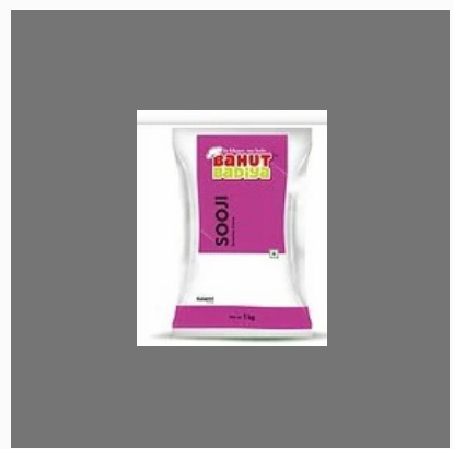
Sooji Semolina Bold