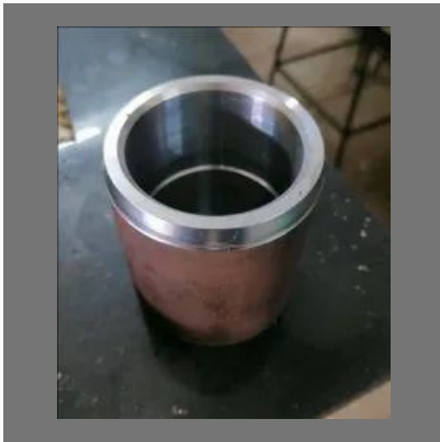
Surface Grinding Service