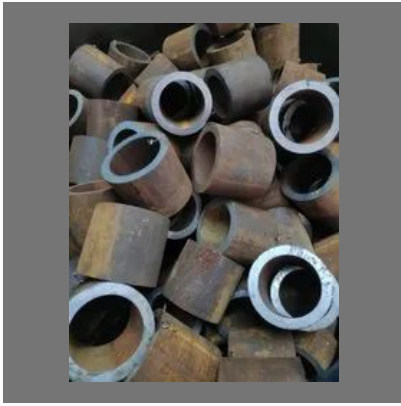
CNC Machined Components