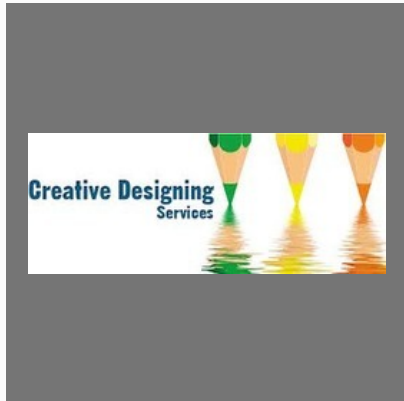
Creative Designing Services