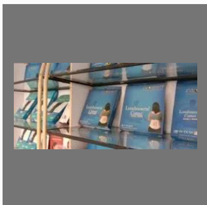
Back Support Belts