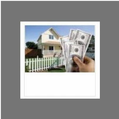
Asset Verification Service