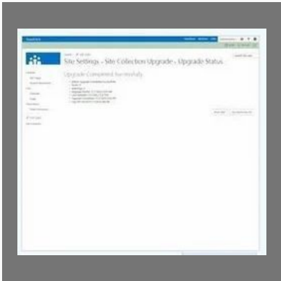
Link Upgradations Service