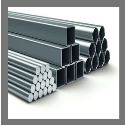
Iron And Steel Products