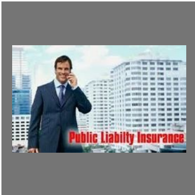
Public Liability Policy