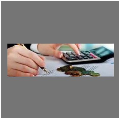
Consequential Loss Policy