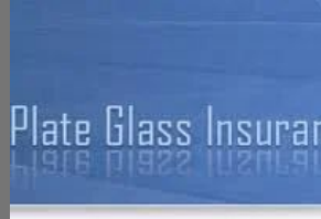
Plate Glass Insurance