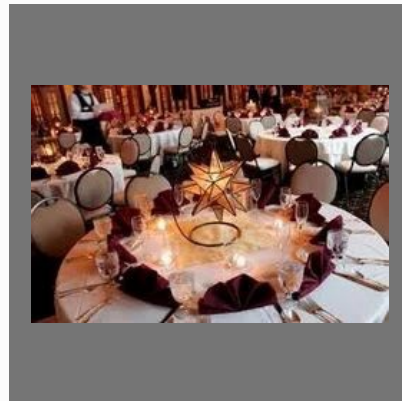
Events Insurance & Wedding Insurance