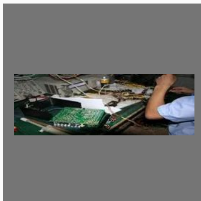
Marine Cum Erection Policy