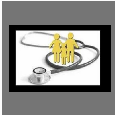
Overseas Mediclaim Policy