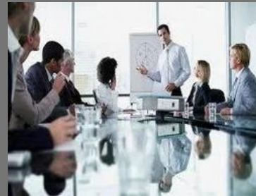
Multi Peril Policy For L.P.G. Dealers