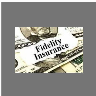
Fidelity Guarantee Insurance Policy