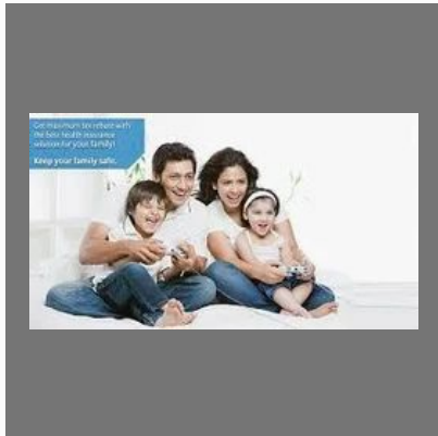
Family Floater Mediclaim Policy