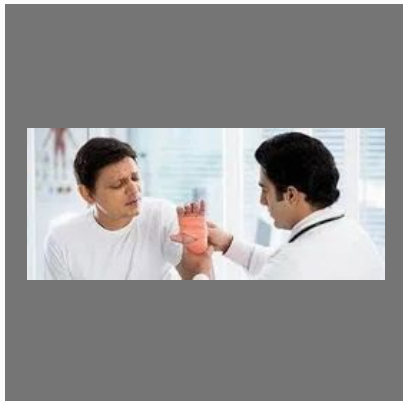
Personal Accident Policy