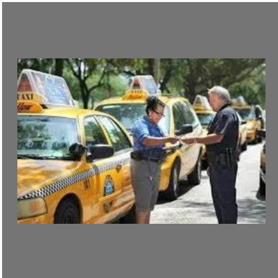
Lift (Third Party) Insurance