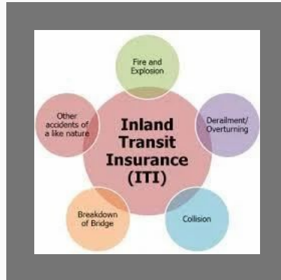
Inland Transit Insurance Policy