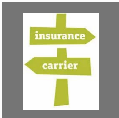
Carriers Liability Insurance