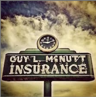
Neon Sign Insurance