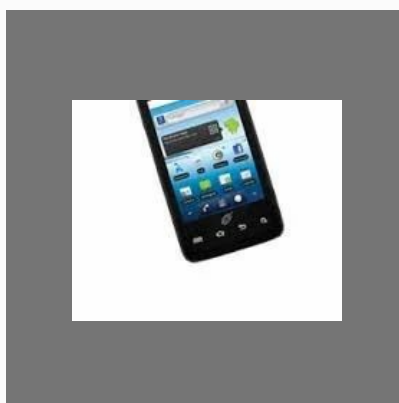
Mobile/Cellular Phone Insurance