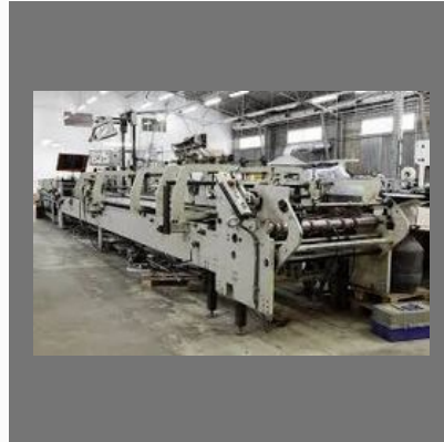
Machinery Breakdown Policy