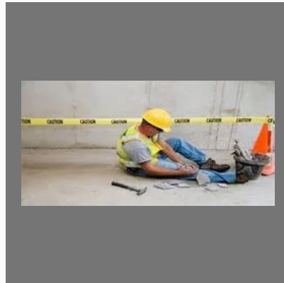
Employers Liability Policy