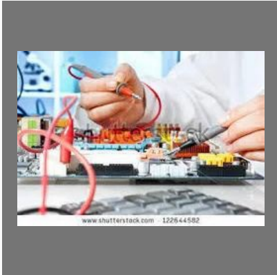
Electronics Equipment Policy