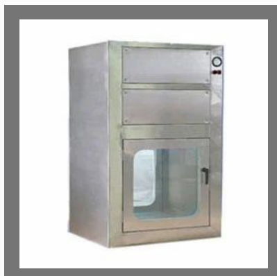
Dynamic Pass Boxes