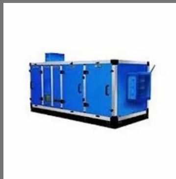
Air Handling Systems