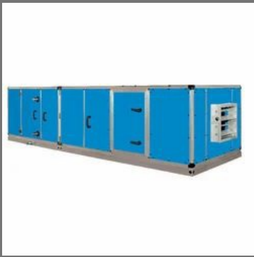
Industrial Air Handling Units