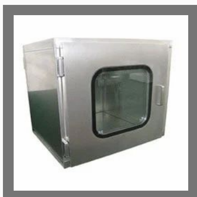
Static Pass Boxes