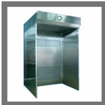
Dispensing Sampling Booths