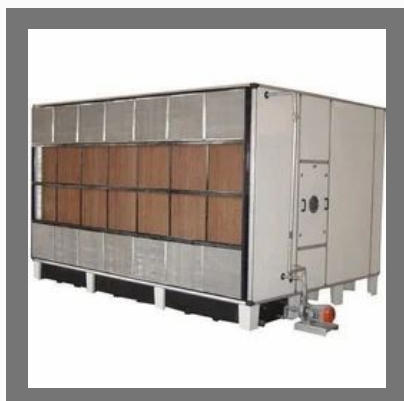
Air Washer Unit