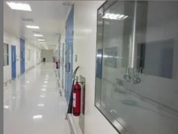
CLEAN ROOM PANELS