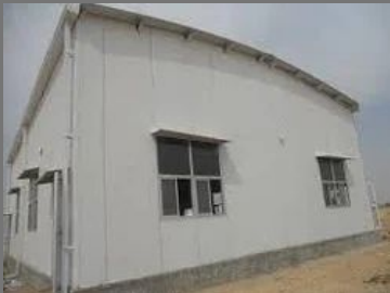
COLD ROOM PANELS