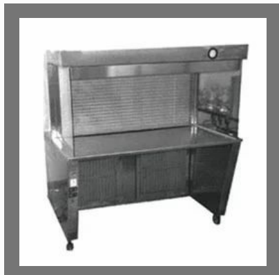
Air Flow Machines