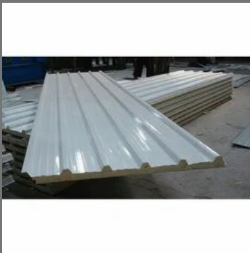
ROOF PUFF PANELS