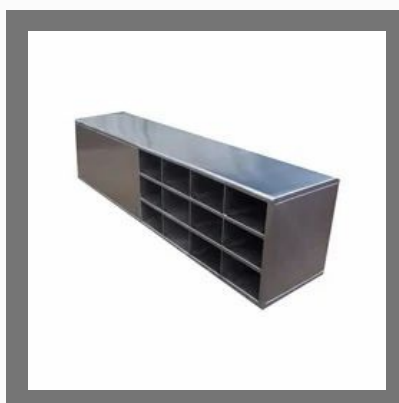
Cross Over Benches