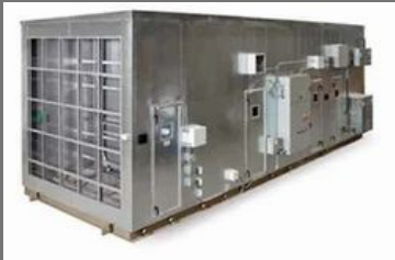
Air Handling Unit