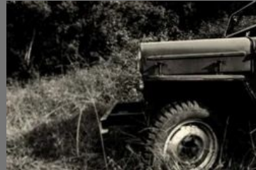
Jeep Rides Tour