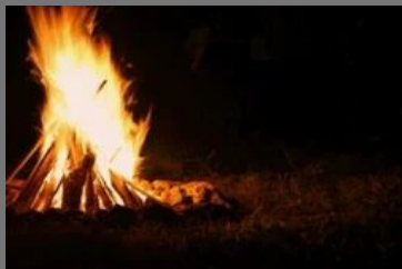
Bon Fires Tour