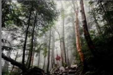
Treks And Trails Tour