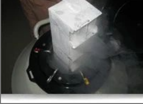
Vitrification & Frozen Embryo Transfer